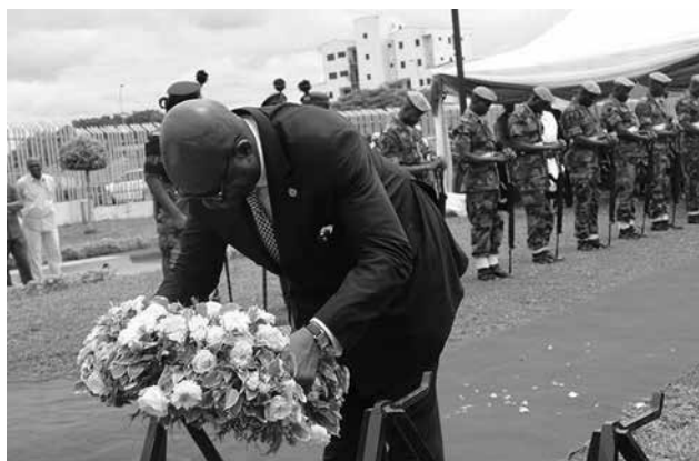
UN Memorial for those killed in the Boko Haram attacks on the headquarters in Abuja in August 2011. Since then the sect has successfully carried out eight concurrent attacks on security offices in Kano.

in the northern Nigerian state of Kaduna, killing more than 50 people. In August 2012, Boko Haram opened fire inside a Deeper Life Bible church during a service in Okene, the northern State of Kogi, killing 19 worshippers. Reprisal attacks on some mosques were reported at that time in the same town.