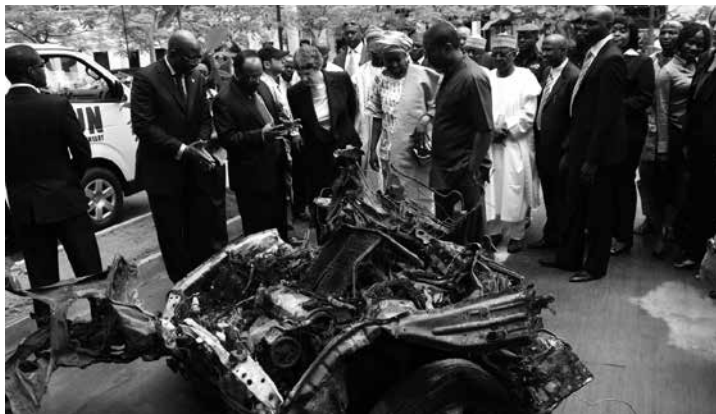
Helen Clark, Administrator of the UNDP, looks at the remains of a car bomb that struck the United Nation's premises in Abuja in 2011.

economy loss, owing to the activities of terrorists going by the name Boko Haram, is a whopping 1.33 trillion Nigerian naira (approximately 1.2 billion euros) Foreign Direct Investment (FDI). 23