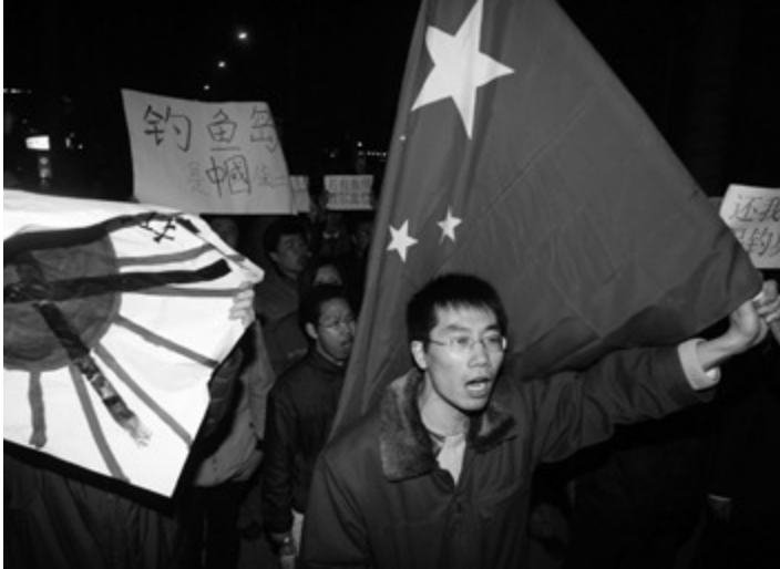
Anti-Japanese demonstrations: Chinese protestors demand Japan's withdrawal from the Diaoyutai/Senkaku islands.