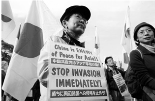
Anti-Chinese demonstrations: In November 2010, Japanese protesters demonstrate against China during a meeting of the Asia-Pacific Economic Cooperation.

in China plunged rapidly. 33 However, when the protests threatened to interfere with public order, they were quickly suppressed by the authorities.