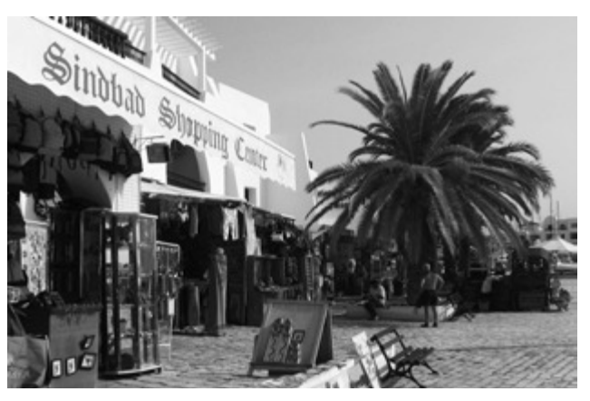
Souvenir shops in the coastal town of Port el Kantaoui: A decentralised regional policy would also assist the tourism sector.

identify more strongly with the development strategy than can be expected from programs designed by the national government. The willingness of local actors to make a contribution to development support (by contributing to the funding of the cluster initiative or by volunteering their time and expertise) is also frequently higher. This is particularly important with an approach such as cluster support, which is often organised on a network basis – as is the case in Tunisia – and requires public and private actors to collaborate as partners. <sup>16</sup>