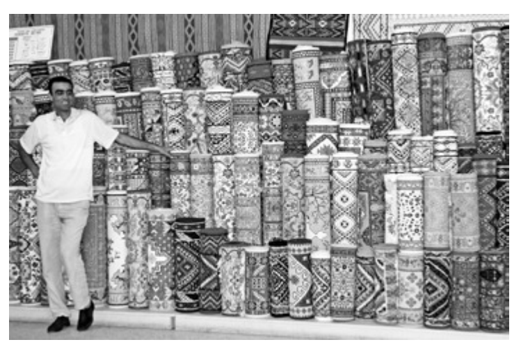
Carpet manufacturing near Kairouan: Promotion of the middle class will be a central task of the local authorities to balance regional disparities.

Tunisia's priorities in regional development policy clearly lie in reducing regional development disparities and combatting youth unemployment. The country has potential for a decentralised regional development policy that includes local and regional actors in politics, administration and the private sector, and compared to other countries in the Middle East and North Africa, it has a high level of economic development and a relatively high level of competitiveness in its economy. One can therefore expect instruments of regional development policy, which make use of the energy, knowledge and commitment available at a local level and which support the regions through targeted assistance from the national level, to boost the dynamic strength of the Tunisian economy and its labour market. However, this will require the bottom-up and top-down approaches to complement one another to good effect.