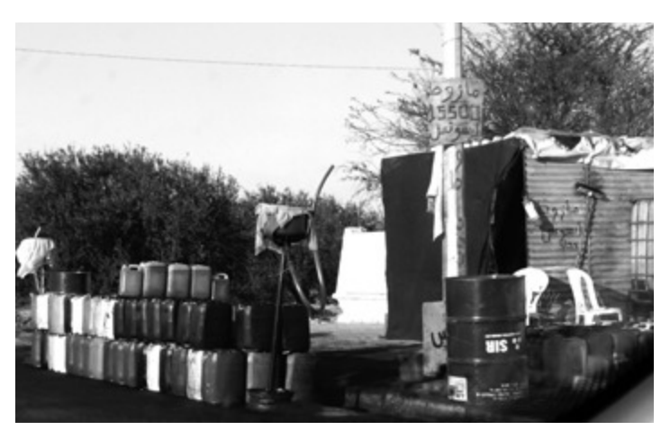
A "gas station" near Sousse: Where investments in transport infrastructure are concerned, the national level will have to take responsibility.

To be able to exploit the potential of lagging areas, regional development policy must utilise local engagement and local knowledge. To this end, it must include local actors in the development areas in the planning and implementation of regional development projects. Consequently, the structural relationships between the national government and the political units in the regions and districts become important prerequisites to the effective design and realisation of regional development policy.