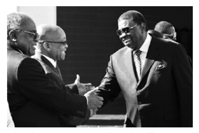
A dependent energy sector: Namibia's President Hifikepunye Pohamba (I.) and his Prime Minister Hage Geingob (r.), here with South Africa's President in 2012, aim for becoming less reliant on energy imports from their neighbouring country.

Without the country's abundance of natural resources and relying purely on foreign aid, the achievements made in the economy and in the social democratisation process since 1990 would probably not have been possible. Namibia is currently the fourth-largest producer of uranium worldwide, and it is assisted in its efforts to consolidate this position particularly by China. Approximately one third of global uranium deposits are believed to be located in Sub-Saharan Africa.<sup>15</sup> It is therefore no surprise that there are plans for the construction of the country's first nuclear power station to improve energy security and reduce its dependence on imports. The government in Windhoek has been pursuing this project actively to become less dependent on oil and electricity supplies from neighbouring countries, particularly South Africa. The future of the energy supply is significant for the country's future development, as are the mineral resources, which are state property according to the constitution. However, their exploration is predominantly in the hands of foreign companies, most of which operate internationally.