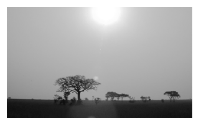
Not only human habitat is endangered, if the extraction of resources does not follow environmental standards. Many of Uganda's national parks such as the Murchison Falls National Park north-east of Lake Albert, are located near potential oilfields.

Even issues of environmental protection (some of the oil reserves are located in a national park) and human rights are reflected in the policy. It calls upon oil companies to adhere to international standards and to invest in further training for the local population, thus creating new jobs.