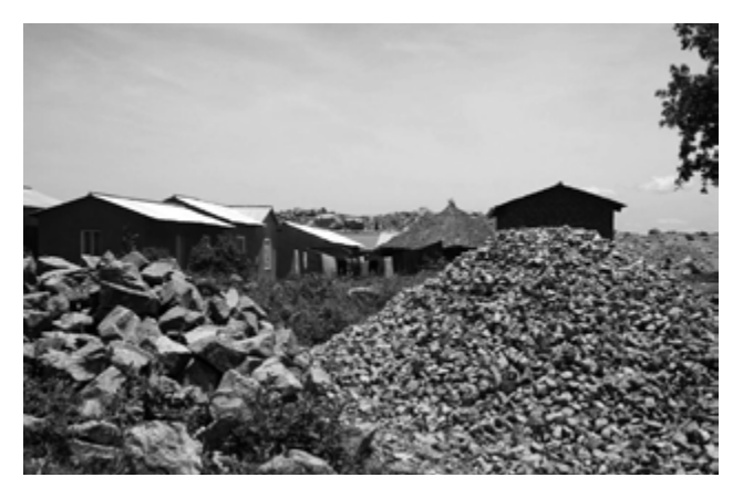
Mining in the North Mara Region: Due to conflicting interests of local farmers, who claim land property rights, the government and extraction companies, the region often witnesses unrest.

It appears EITI membership at least is helping to make the entire issue of the equitable distribution of the profits from gold mining more transparent. Since December 2012, Tanzania has been fulfilling all EITI standards and is thereby one of currently 27 countries worldwide who can boast "EITI compliant" status. The revenues the government is achieving from mining as well as the taxes and levies paid by the mining groups are therefore made transparent and reconciled in annual reports. While this is bringing some objectivity to the debate, many other problems persist, such as pollution, the issue of the land rights of the local population, a lack of jobs and inadequate social support for the population. Because even if the contribution the mining groups make to the Tanzanian national budget increases, this does not necessarily mean the government will reinvest these funds in social programs or in improved education and healthcare provision for the population.