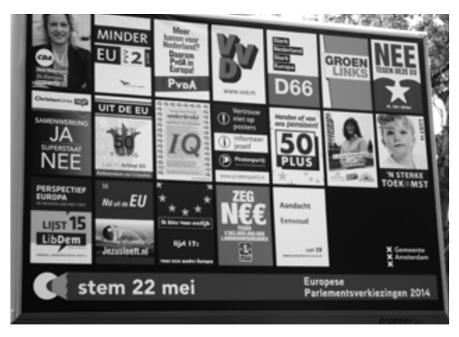
European Elections 2014: The party's Manifesto on Europe (as of June 2013) reflects the logic of the pro-European party program and calls for stronger economic policy coordination and a strengthening of foreign and security policy.

stressing it excessively would frighten off urban voters and those without religious affiliation. However, dropping the "C" from the party name was never considered, partly because the associated values had served as keystone and guide in the party program.