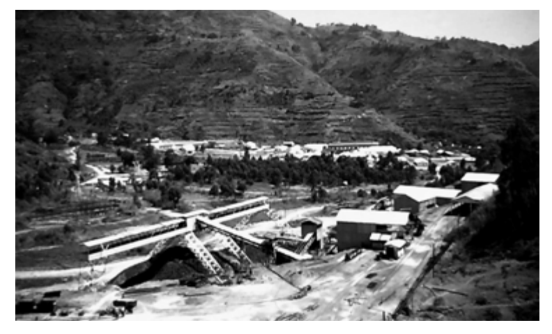
Uganda has plenty of natural resources: In order to distribute the revenues from the extraction of commodities such as copper or cobalt, like here at the Kilembe Mine in the country's southwest, a legal framework is necessary.