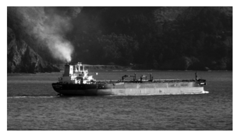
A tank ship of the state-owned oil company SONANGOL: Assumingly, the state holds 51 per cent of the company to preserve its interests.

production in Angola for years in the early days.<sup>44</sup> Through exports to China, Russia and the USA alone, over 48 billion euros were invested in Angola in 2012, and thanks to the oil, the country has experienced annual economic growth rates up to and above ten per cent over the last ten years. Today Angola's GDP is the fifth-biggest in Africa,<sup>45</sup> which may explain the temporary assignment of central negotiating positions within the AU.