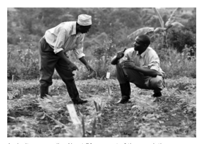
Agriculture prevails: About 70 per cent of the population pursue agricultural activities, thus contributing almost 25 per cent to Uganda's GDP.

cultural heritage jeopardised as they are being obstructed in conducting their traditional rituals.<sup>61</sup>