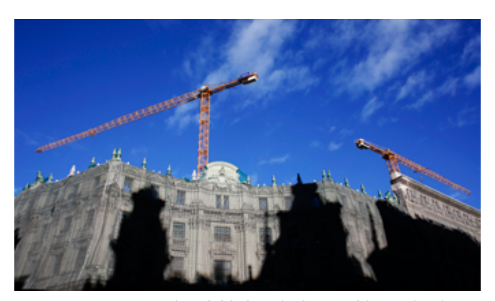
Cranes on the roof of the former headquarters of the Spanish credit bank: The building will be converted into a five star hotel. In recent years, Spain has experienced an almost unchecked construction boom.

The reality of the situation came as a shock. For years, the Spanish had enjoyed a virtually unhindered construction boom as well as cheap loans, with which they could easily fulfil all manner of dreams. Politicians and the banks had led them to believe that the (borrowed) prosperity and joie de vivre would last forever. While banks had previously encouraged even people on a low income to ignore their (financial) limits, they were now sending their emissaries or even the police to clear the homes of those who could no longer pay the interest they owed.