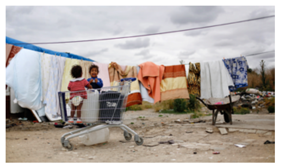
Children in the outskirts of Madrid: In 2011, almost a quarter of all Spaniards lived below the poverty line – defined as 60 per cent of the average income.

It has to be said that if asked personally any sensible person would have declined to accept the legacy that Rajoy and his government took on in the winter of 2011. Unemployment had risen to nearly five million, and a truly scandalous youth unemployment rate meant that almost every second young person under 26 had no career prospects. 21.8 per cent of Spanish people were living on less than the 60 per cent of average earnings that was defined as the poverty limit, particularly large numbers in Extremadura (38 per cent) and on the Canary Islands (31 per cent). And while Zapatero had inherited a budget surplus from his conservative predecessor Aznar back in 2004, the coffers were empty when Rajoy took over, Spain was heavily in debt and there was no further scope for measures to boost the economy.