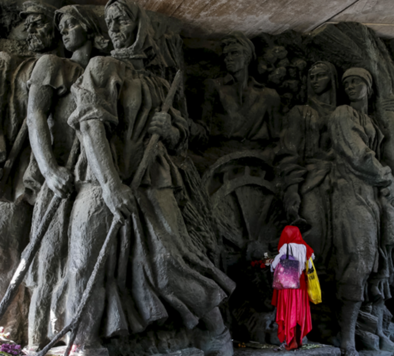
Propaganda 1.0: In the past it was set in stone, but today, interpreting historical events is increasingly battled out on the Internet.

for safeguarding democratic standards. Russia, Azerbaijan, and Kazakhstan, for example, have sought to limit the human rights and democracy initiatives of the Organization for Security and Cooperation in Europe (OSCE) by curbing its budget and subverting genuine election monitoring, often by promoting “zombie” election observers who sanction fraudulent votes. 4 The OSCE’s Office for Democratic Institutions and Human Rights (ODIHR) has been a consistent target of the authoritarian regimes that are among the 57 OSCE member states. The