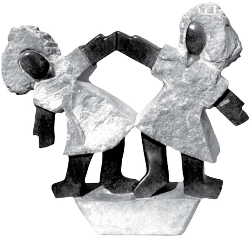
Sculpture created from Serpentine in 2000 by Dominic Benhura