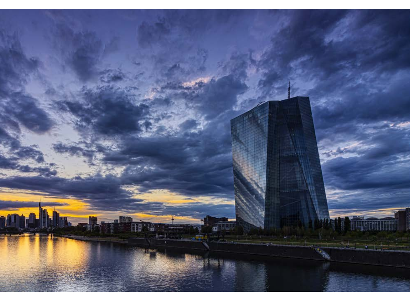
The headquarters of the European Central Bank in Frankfurt: The ECB has been providing indirect support for the budgets of highly indebted euro countries with its bond purchase programmes for quite some time now.

Instead, the SGP should be reformed with the aim of establishing simpler rules and more efficient enforcement. The economists Matthes and Sultan recommend that the planned debt reduction paths should introduce a benchmark requiring that net primary expenditure is lower than potential growth by a certain margin, for example. Increases in expenditure would therefore be lower than economic growth on average, normally resulting in a drop in the debt-to-GDP ratio.<sup>28</sup> Another possibility would be not to rely exclusively on financial sanctions in the event of rule violations. Politically speaking, it is difficult for the Commission to impose further financial burdens on member states that already face