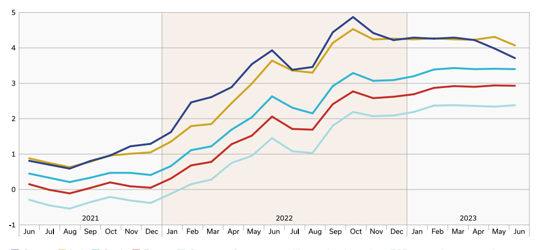
■ Greece ■ Italy ■ Spain ■ France ■ Germany

Fig. 2: Interest Rates on Ten-year Government Bonds (Interest Rates in Per Cent)