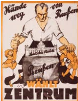
The ACDP's poster collection expanded by a number of valuable items – here a campaign poster by the Zentrum party for the 1932 Prussian state elections.