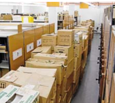
Documents from the office of Heiner Geißler.

Aside from research of party materials at the federal, state and county level, third-party funded projects also play a substantial role. As in years gone by, the German Bundestag funded the acquisition and description of 90 metres of correspondence by the CDU's parliamentary group as well as records from members of parliament, which the general public now has access to. Part of this project allowed for the cataloguing and digitalisation of 500 CDU campaign posters from federal elections.