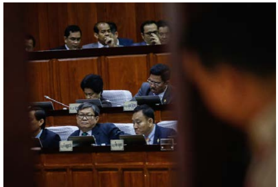
Opposition lawmakers attending a session of the National Assembly in Phnom Penh, ending their six-month boycott.

allegedly linked to a group of CNRP in Adelaide. Despite announcing otherwise, Kem Sokha didn't leave the party's head quarter to join the parliamentary session, where he has been staying for the last half year to avoid the charges set up against him. Instead, he was one of more than a dozen opposition lawmakers absent when the assembly debated the next year's budget. Sokha only left the head quarter once within the last six months in order to register for the upcoming elections in 2017 (commune election) and 2018 (national election).