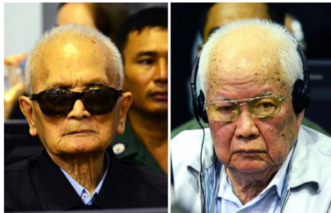
Nuon Chea (left) and Khieu Samphan (right) listen to the announcement of the appeal judgement at the Khmer Rouge tribunal this morning.

The 23th of November is a remarkable day in the history of Cambodia. It is the first time senior Khmer Rouge leader have been officially recognized by the court as being guilty of crimes committed during the Khmer Rouge regime. In 2014 the regime's two top surviving leaders Nuon Chea, who was the second-in-command to Khmer Rouge leader Pol Pot and Khieu Samphan, former president of the state and high ranked official during the Khmer Rouge time, have been found guilty of crimes against humanity by the Extraordinary Chambers in the Courts of Cambodia (ECCC), a court established to try the most senior responsible members of the Khmer Rouge crimes during the Cambodian genocide. After