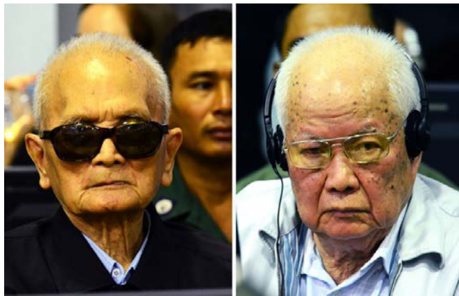
Nuon Chea (left) and Khieu Samphan (right) listen to the announcement of the appeal judgement at the Khmer Rouge tribunal this morning.

The 23th of November is a remarkable day in the history of Cambodia. It is the first time senior Khmer Rouge leader have been officially recognized by the court as being guilty of crimes committed during the Khmer Rouge regime. In 2014 the regime's two top surviving leaders Nuon Chea, who was the second-in-command to Khmer Rouge leader Pol Pot and Khieu Samphan, former president of the state and high ranked official during the Khmer Rouge time, have been found guilty of crimes against humanity by the Extraordinary Chambers in the Courts of Cambodia (ECCC), a court established to try the most senior responsible members of the Khmer Rouge crimes during the Cambodian genocide. After