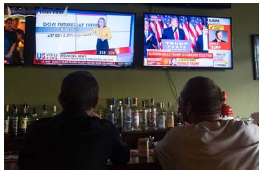
People watching US election coverage in a bar in Phnom Penh.

The biggest possible threat for Cambodia is a rethinking of trade preferences by the Trump administration, as Mr. Trump announced an economic protectionism. Less trade with Cambodia would especially affect the garment sector, which relies heavily on the U.S. market: According to the International Labor Organization (ILO), the United States accounted for 34-36 % of Cambodian total garment and footwear exports in 2014;