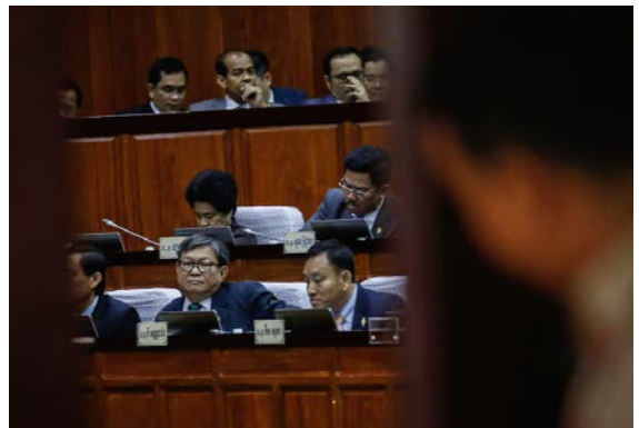
Opposition lawmakers attending a session of the National Assembly in Phnom Penh, ending their six-month boycott.

allegedly linked to a group of CNRP in Adelaide. Despite announcing otherwise, Kem Sokha didn't leave the party's head quarter to join the parliamentary session, where he has been staying for the last half year to avoid the charges set up against him. Instead, he was one of more than a dozen opposition lawmakers absent when the assembly debated the next year's budget. Sokha only left the head quarter once within the last six months in order to register for the upcoming elections in 2017 (commune election) and 2018 (national election).