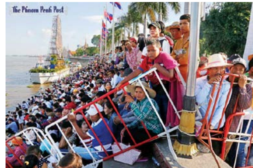
People gathering on the bank of the Tonle Sap to watch the famous Water Festival boat races in Phnom Penh.

One of Cambodia's most important national festivities has been back to Phnom Penh this November: The so called Water Festival. What used to be an annual tradition was held for only the second time in six years from November 13 th to 15 th in the countries capital. In the past years, the government mostly cancelled the festival due to weather conditions, whereas in the 2012 edition, the death of the late King Father Norodom Sihanouk was the reason for the cancellation.