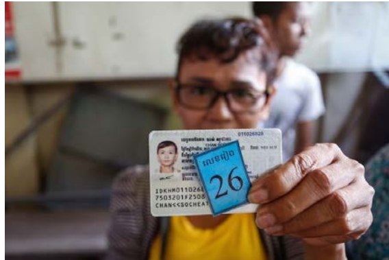
A woman holds up her new identification card after registering to vote in Phnom Penh in September.

During the registration process from September 1 st to November 29 th about 7.7 million citizens newly signed up to a digital voter databank. Not least because of the high efforts in promotion by the NEC and the political parties more than 76 percent of the 9.7 million eligible voters could be