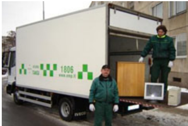
Laureate 2010: EMP Recycling UAB