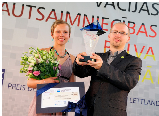
Laureate 2010: Madara Cosmetics SIA