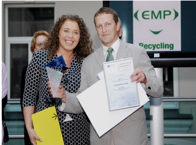
Laureate 2010: EMP Recycling UAB