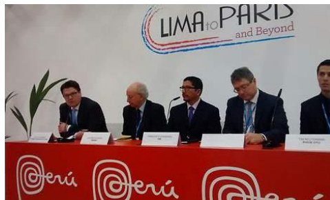
Official Side Event at COP 21.