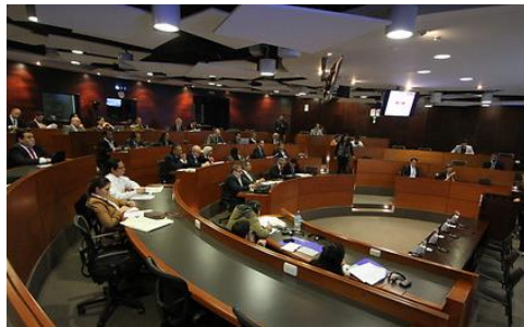
Day 1: Expert seminar on renewable energy

Event in Lima on September 14th-15th, 2015 organized by the Konrad Adenauer Foundation's Regional Programme Energy Security and Climate Change in Latin America and the Universidad del Pacífico's Responsible Management Center.