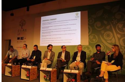
After the presentations, the audience had the opportunity to ask questions and make comments.