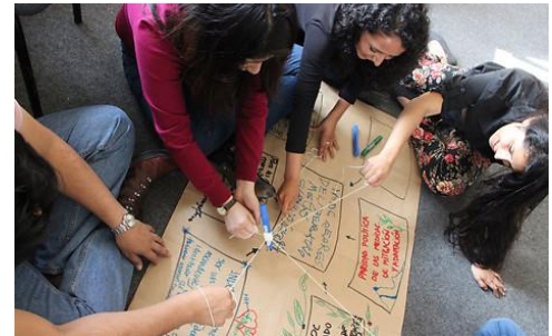
Group dynamic on INDCs.