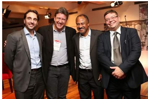
Representatives of Brazilian cities.