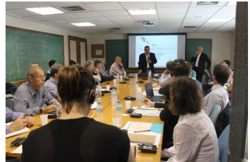
Welcome of FGV.