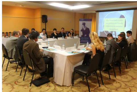
Q & A.