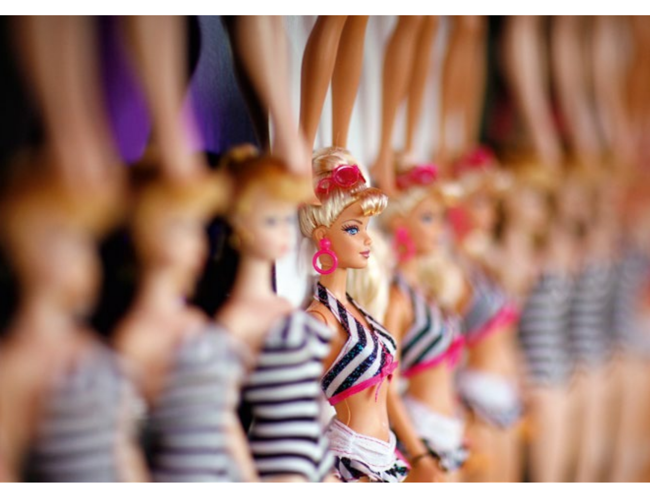
From Alexa to Barbie: It is no longer a thing of the future that everyday objects are surveying us.

data such as praise or complaints from fellow citizens and government agencies to create a ranking list based on a scoring system of up to 800 points for individuals. This calculation also includes basic demographic data. So, for example, a 28-year-old pregnant woman will enjoy a better "rating" than an 18-year-old who purchases a motorbike. Someone who has 700 Sesame Credits is considered to be extremely respectable, whereas a score of 300 may lead to social repercussions, such as not being able to book an international flight. The official aim is to counteract corruption and untrustworthy patterns of behaviour, and to create greater reliability in economic and interpersonal transactions. Anyone who has ever been to China has been