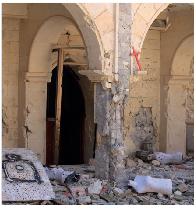
THE DESECRATED CHURCH OF THE IMMACULATE CONCEPTION IN QARAQOSH, USED BY ISIS FOR TRAINING FIGHTERS AND TARGET PRACTICE

This section discusses some of the challenges that displaced minority members continue to experience in Iraq almost three years after the fall of Mosul to ISIS.