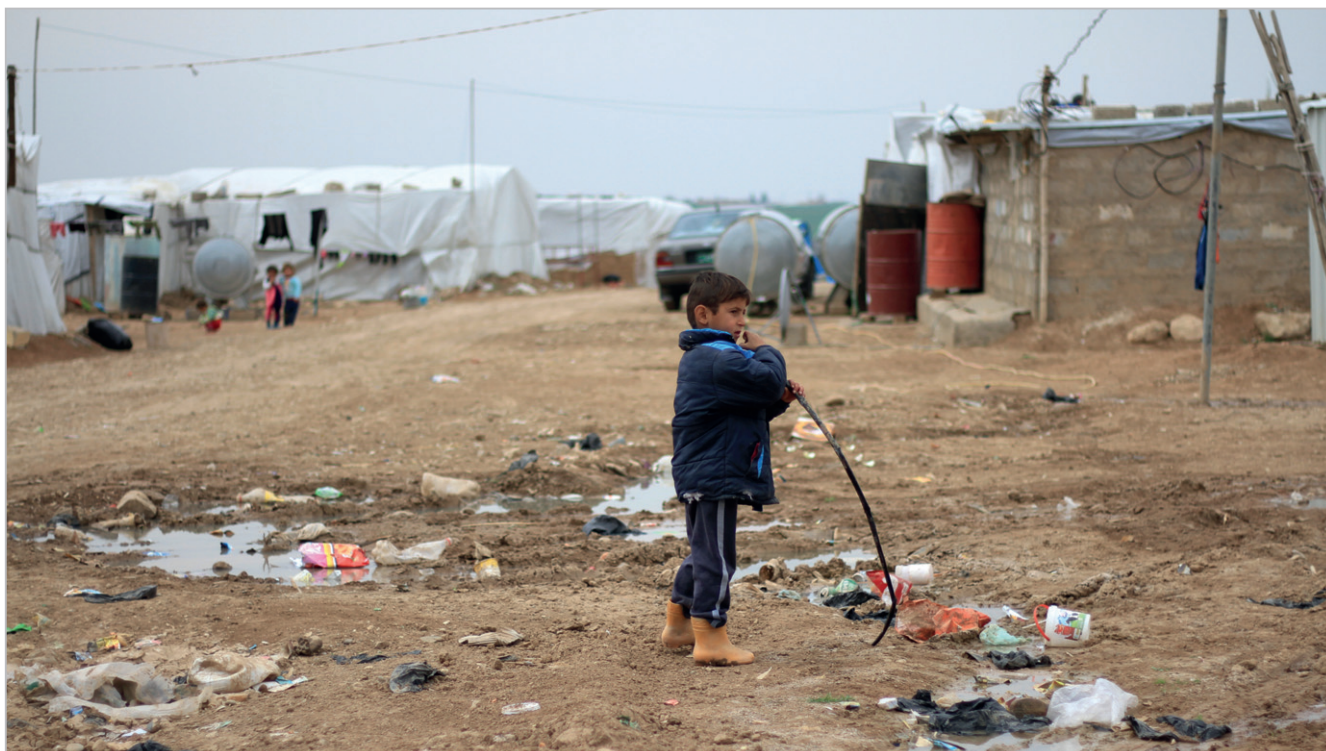
KHANKE INFORMAL CAMP, DOHUK

Christian military commander, Dohuk, March 2017