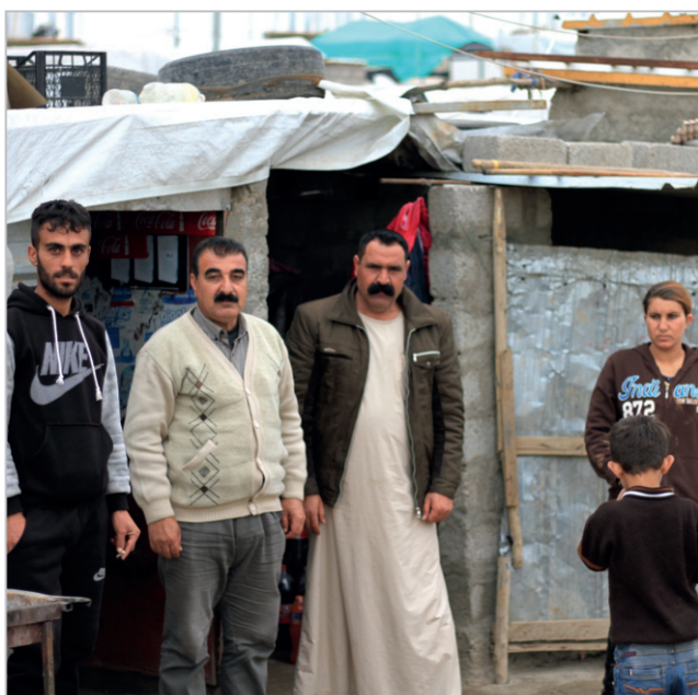
INTERNALLY DISPLACED PERSONS IN KHANKE INFORMAL CAMP, DOHUK

Though culturally distinct, with their own customs, traditions, clothing and language, Shabaki – a mixture of Farsi, Arabic, Kurdish and Turkish – community members have been pressured to identify as Kurdish and experience persecution from both Kurds and Arabs as part of their broader territorial dispute over control of areas of Ninewa. 21 Shabak in Mosul have been forced to leave due