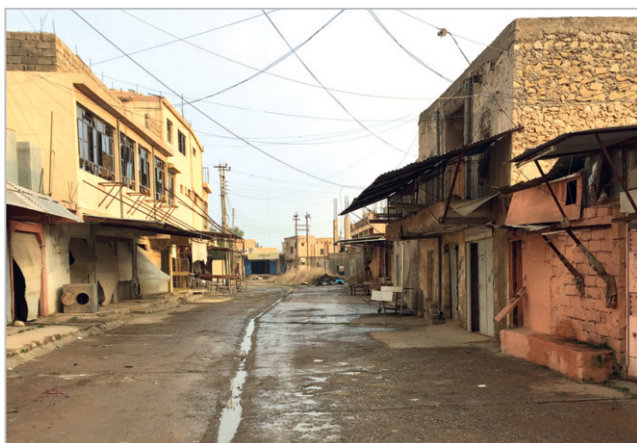
A VACANT TEL ESKOF STREETScape / WILLIAM SPENCER

The focus of much recent media coverage has been the steady rollback of ISIS forces from its former territory, with military and paramilitary forces regaining control of large swathes of the Ninewa plains in the latter months of 2016 and the ongoing battle to secure the remaining areas of ISIS-occupied Mosul. On the face of it, this would suggest that the atrocities and mass displacement that began with the group's sweep across northern Iraq in the summer of 2014 could soon come to a close.