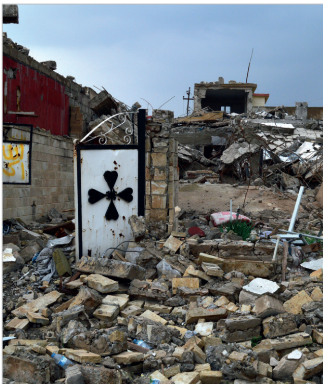
DESTROYED CHURCH BUILDING, TAL KAIF DISTRICT, NINEWA GOVERNORATE

While it is certainly a matter of the utmost urgency to provide humanitarian assistance to populations affected by the war and to meet their security needs, it is equally crucial to address the root causes of the conflict. 165 In this way, the international community can assist in finding lasting political solutions by addressing the grave injustices that caused it. Transitional justice – defined by the UN as ‘the full range of processes and mechanisms associated with a society’s attempt to come to terms with a legacy of large-scale past abuses, in order to ensure accountability, serve justice and achieve reconciliation’ 166 – is an important vehicle to achieve this. Possible approaches to achieve these ends in Iraq are explored further in this section.