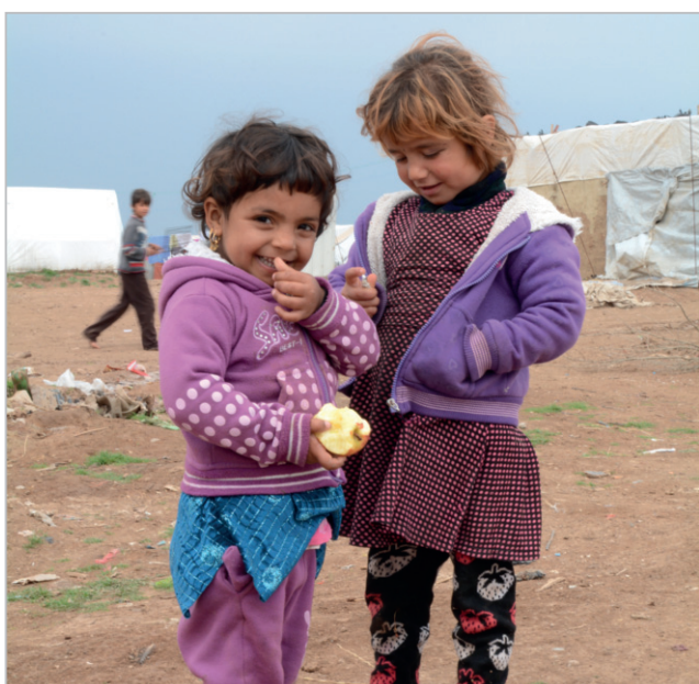
IDP CHILDREN, NORTHERN IRAQ / ALESSANDRO MANNO

In the first two weeks of August, ISIS expanded its occupation of northern Iraq, capturing Sinjar, Mosul Dam, Kocho and other areas north and west of Mosul, as well as Qaraqosh and other towns and villages to the south and east. The group subsequently advanced to within 40 kilometres of Erbil, capital of the KR-I.