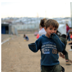
Yezidi girl, from Khanke camp, near Dohuk