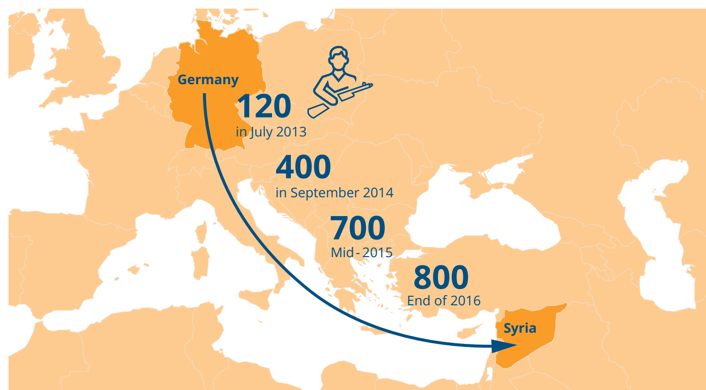
Figure 2: German departees to Syria from 2013 to 2016

The total number of Germans who left for Syria is around 1,070, of whom about 80 per cent joined IS. According to a study by German security agencies, the total number of departees grew from a few isolated cases at the end of 2012 to more than 120 in July 2013, then to almost 400 in September 2014, more than 700 in mid-2015, and nearly 800 at the end of June 2016.<sup>28</sup> The number of departures already began to decline sharply at the beginning of 2015. It is possible that the potential for willing recruits in Germany – where the number of jihadists was already roughly estimated to be around 1,000 to 2,000 at the time – was largely exhausted. In addition, the falling numbers were likely a result of the imprisonment of important recruiters in Germany, the measures taken by the German security services to hinder departures, and the defeats that IS suffered starting in spring 2015.