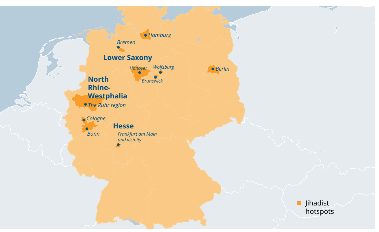
Figure 1: Jihadist hotspots: where Syria fighters came from

this hypothesis. Many Salafists around the world believed that there was an obligation to go to Syria from this moment on, since a genuine Islamic state had come into being again after nearly a century in which there was not any.