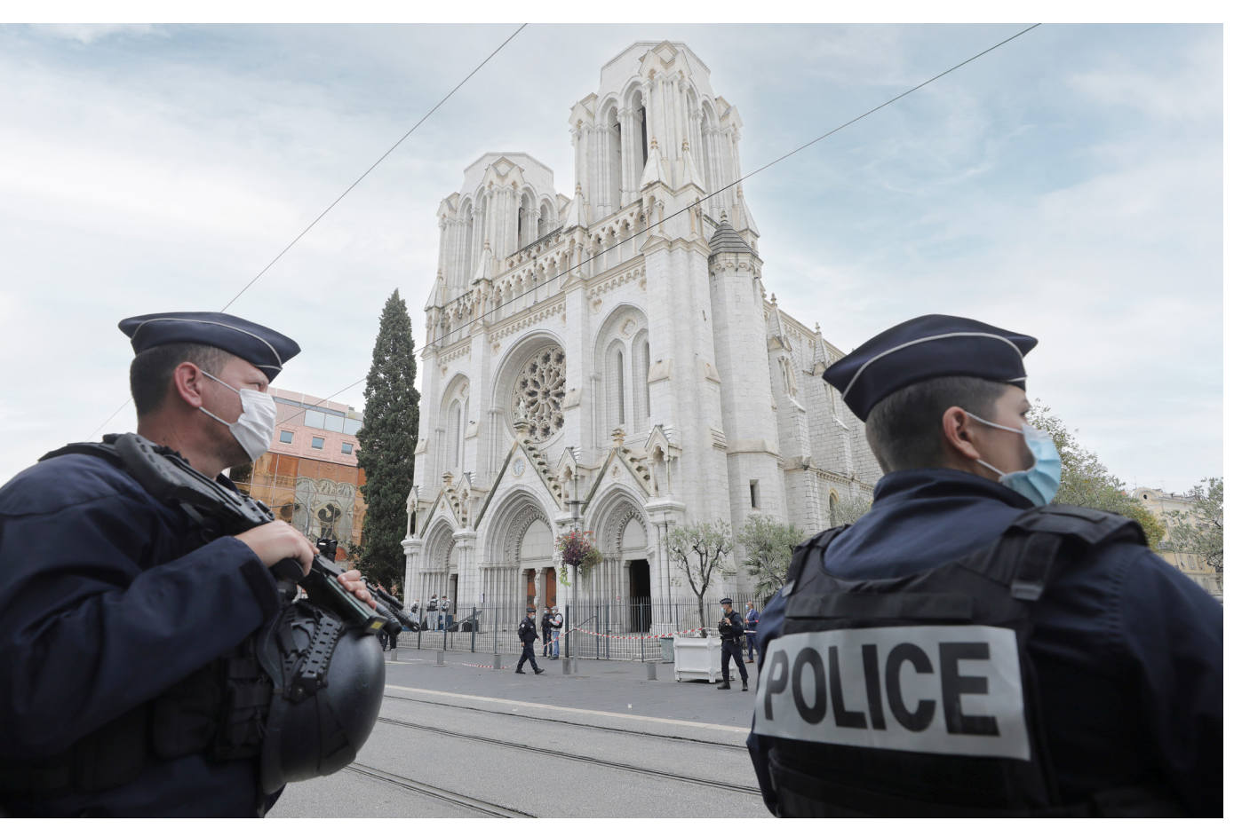
After the beheading of a teacher outside his school in a Paris suburb followed by a deadly attack inside the basilica, police officers stand guard near Notre Dame church in Nice, southern France, October 29, 2020.

After the 2015 series of attacks, the state implemented a policy to prevent and detect radicalization, led by the Ministry of the Interior and the state of emergency was extended several times. Furthermore, border control was reestablished and the operation Sentinelle put in place.<sup>59</sup> An unprecedented overhaul for intelligence surveillance led to the passing of the July 2015 Intelligence Act.<sup>60</sup> In addition to increased surveillance measures, the militarization of the French response – including the use of armed forces on its own territory – is unique in Europe. One may question whether the presence of soldiers in the public space, instead of gendarmerie or police officers, is a pacifying or provocative factor. On the one hand, the domestic deployment of soldiers might incite attacks and thus play as an aggravating factor. On the other, soldiers are trained to face such risks and if their role is to deviate the threat from civilian targets, acting as 'standing docks' and visible targets serves then the overall objective. Whether the military is a credible deterrent is an open question. It is fair to say however, that these measures have been widely supported by the French public.<sup>61</sup>