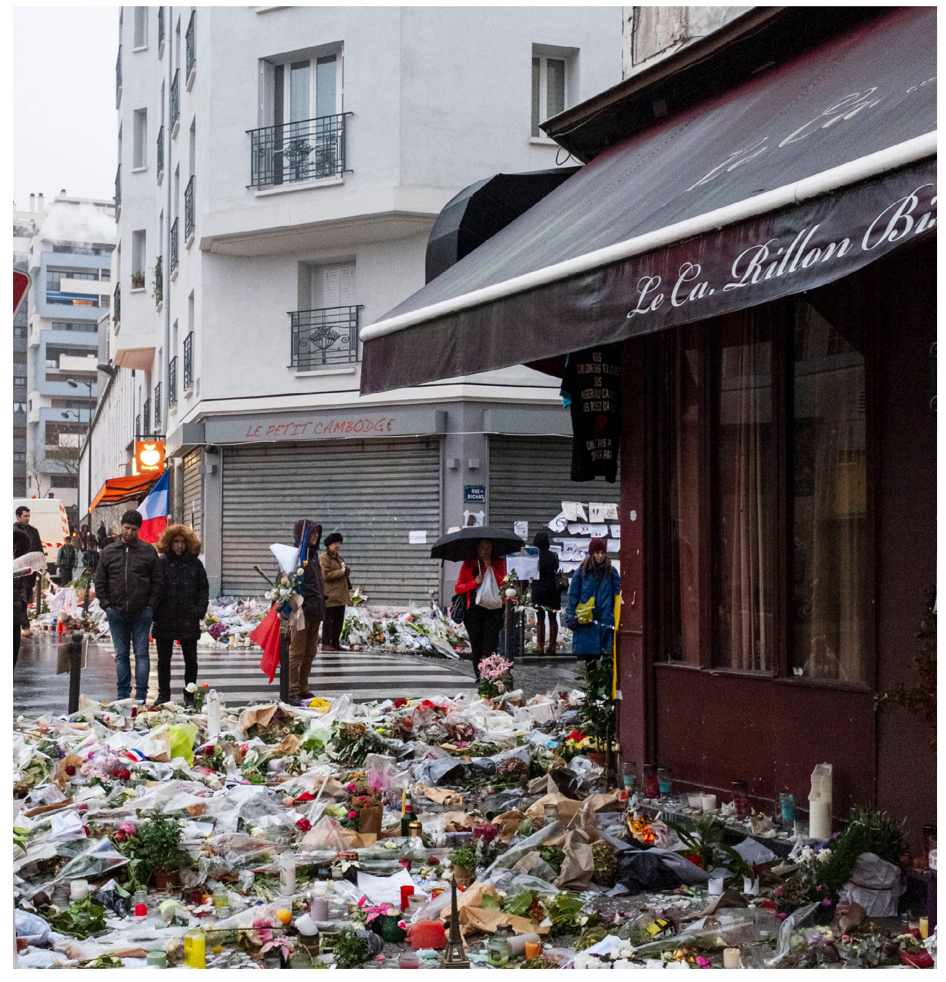
Statements of condolence outside Le Carillion bar the day after the terrorist attack on Rue Bichat in Paris, November 14, 2015.

This publication is part of a study series, which includes the evaluation of the terrorism threat, the jihadist scene's radicalization patterns and its root causes in different European countries. The series considers and explores different, at times opposing, positions of the scientific debate surrounding this topic.