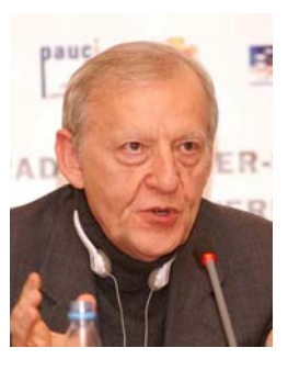
Ian Boag, Head of Delegation of the European Commission to Ukraine: