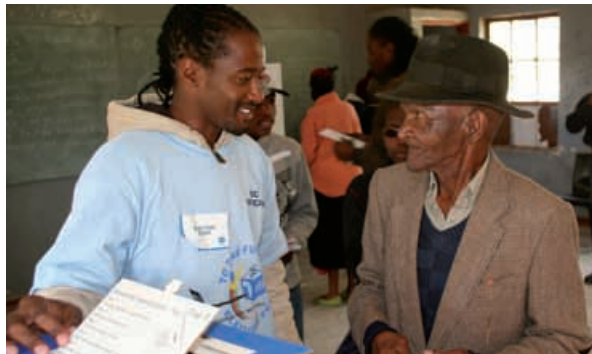
A polling assistant helps senior citizens vote

After talking in a series of lectures on the constitution, the election system and the party landscape, radio and TV journalists from Botswana, Lesotho, Namibia, Tanzania and Uganda were able to immediately apply their newly acquired skills. For example, one programme item was visiting a campaign rally with Nelson Mandela and several polling stations in Soweto, as well as observing the ballot counting process at the electoral commission headquarters. The reporters had