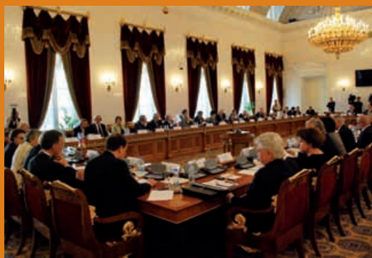
More than 50 judges took part in the dialogue at the conference hall of the Russian Constitutional Court.

Germany is celebrating the important anniversary of 60 years of its constitution. Konrad Adenauer, the president of the Parliamentary Council, signed the document on 23 May 1949. The Konrad-Adenauer-Stiftung is honouring the anniversary with several events at home and abroad. The German constitution, German constitutional court decisions and constitutional law are all met with great interest in many countries in the world. This gives the Foundation many chances to fulfil its mandate to support the development of democracy and the rule of law.