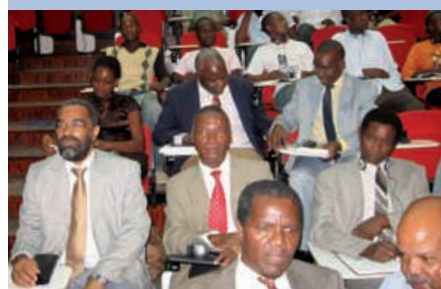
Book presentation dedicated to democracy and rule of law

The Swedish ambassador, the designated president of the Supreme Court of Mozambique and numerous legislators and lawyers attended the festive gathering.