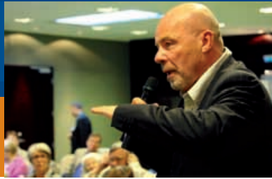
Former minister of state Heinz Eggert in Riga