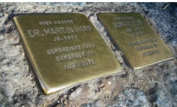
„Stumbling blocks“ in Berlin-Mitte

On invitation from the KAS, 15 independent journalists from Belarus travelled to Germany for five days at the end of April to learn more about how Germans come to terms with the past, and to visit several commemoration sites in Berlin and the state of Brandenburg.