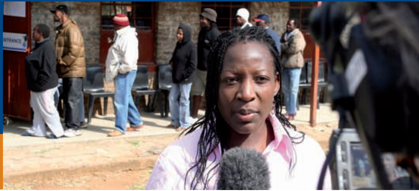
Action: Reporting for a TV station from a polling station in Soweto