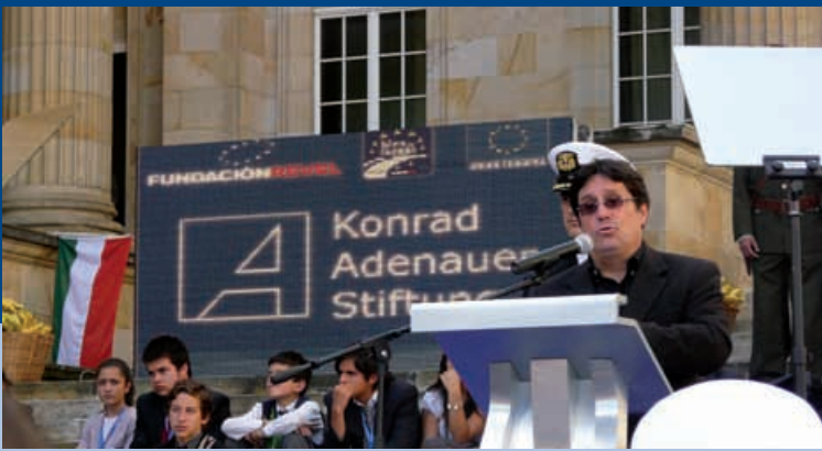
Colombia's Vice President Francisco Santos