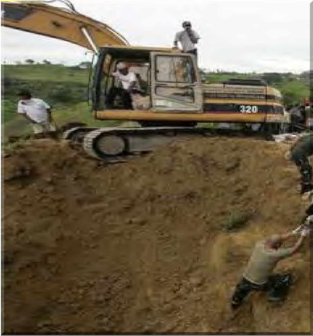
Members of the SOCO retrieve the bodies of the massacre victims. Starkly noticeable is the backhoe used by the perpetrators in digging the hole and burying therein the hapless victims of the gruesome crime.