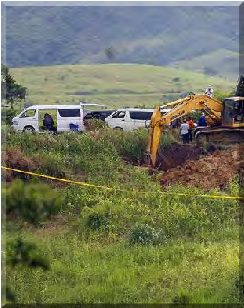
Massacre site at Barangay Salman in Ampatuan, Maguindanao.