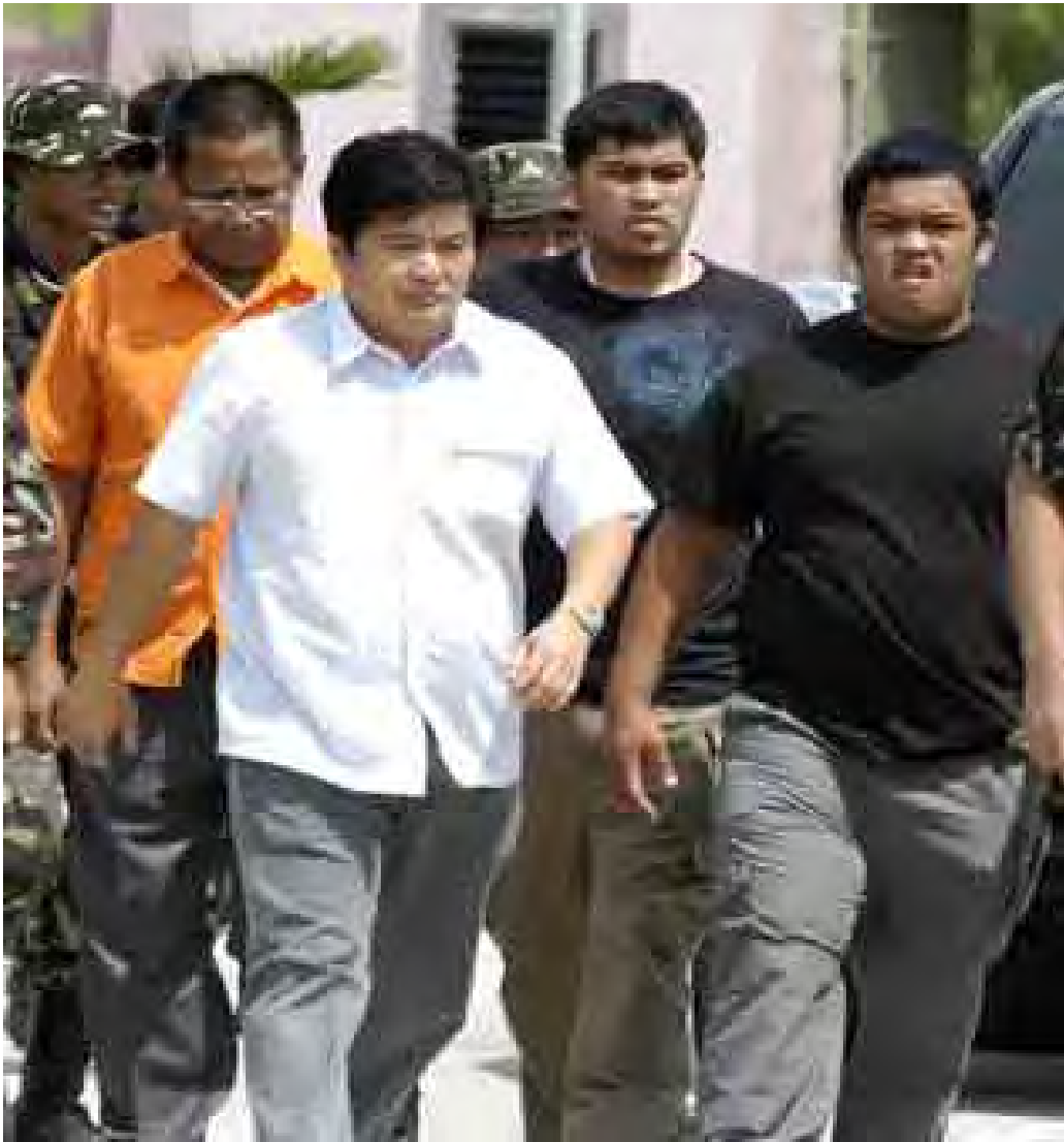
Escorted by soldiers after his surrender to authorities in Sharif Aguak, Maguindanao, Datu Unsay Mayor Datu Andal Ampatuan, Jr. (second from right) is accompanied by his wife and brother former ARMM governor Zaldy Ampatuan (left) toward the helicopter that would bring him to General Santos City.