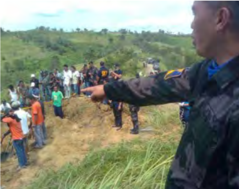
A member of the military first to arrive on the scene points to the digging that serves as the makeshift grave of the massacre victims.