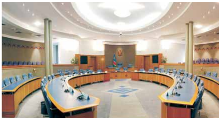
The National Council takes maximum 30 days to discuss an Appropriation Bill and maximum 90 days to debate other bills.

In case the President refuses to sign a bill which he/she thinks is in conflict with the Constitution, the court may be asked to intervene. If the court determines that the bill is in fact in conflict with the Constitution, such bill cannot become law. However, if the court finds that the bill conforms to the Constitution, the Bill is sent back to the President to effectively sign it into law. Interestingly, this scenario has not been experienced yet in independent Namibian legislative history.