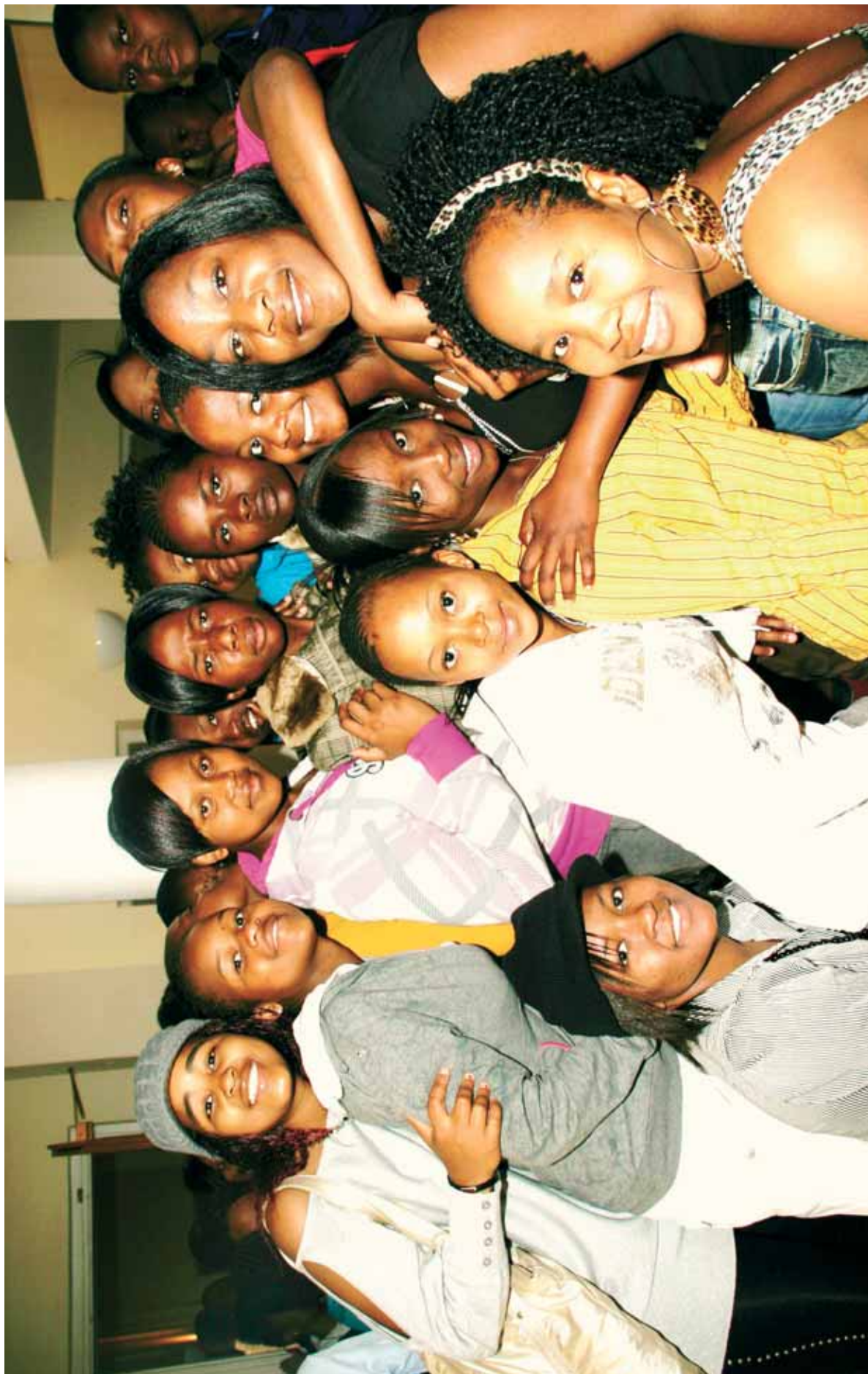
South Africa's Harry Oppenheimer Agricultural High School students in the Chamber of the National Assembly, July 2010.