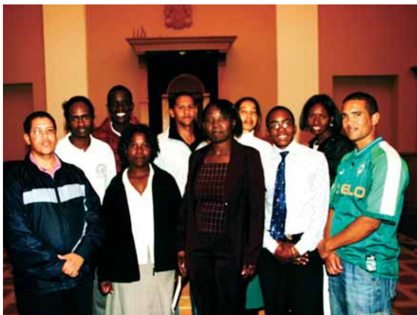
NETS ecumenical students seeking to better understand the concept of democracy.

Established in 1991, NETS started with classes in January 1992 as a new ecumenical project built on an evangelical foundation. To date, the seminary has about thirty residential students and more than six hundred studying by distance.