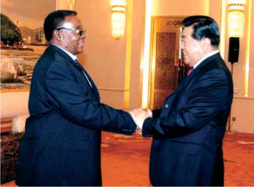
Chairman Asser Kapere and Chairman Jia Qinglin (right) vowing to enhance parliamentary relations.

each others' countries to exchange information on issues of common interest. The Namibian legislator suggested cooperation in various fields which the Chinese lawmaker undertook to consider seriously. Chairman Wu thanked Chairman Kapere for showing sympathy with the Chinese Government and people over the recent floods, drought and earthquake which was affecting regions in the Sichuan Province.