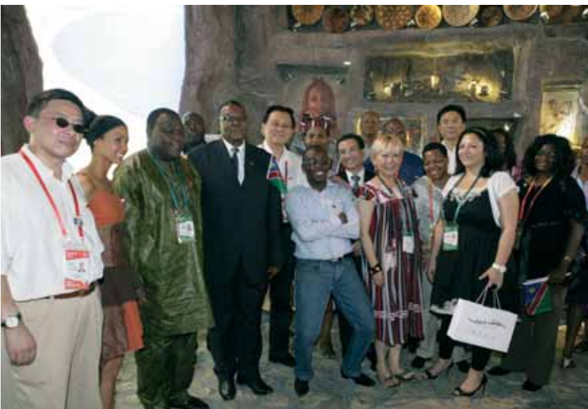
The delegation visiting the Namibia Pavilion at the EXPO 2010 Shanghai.

Chairman Jia maintained that Namibia was China's "all-weather friend" in Africa as both countries had fought for sovereignty, characterising relations between the two countries as strong and built on a solid foundation over the past 20 years. According to Chairman Jia, the good relations between the Chinese People's Political Consultative Conference and the National Council of Namibia was further affirmed by the two high level visits to each others' countries this year during which ideas were exchanged on legislation, governance and improvement in the living standards of their people. He said he was pleased to meet Founding President, Dr. Sam Nujoma at the official opening of the 2010 EXPO Shanghai, emphasising that Dr. Nujoma was an old friend of China whom China would never forget.