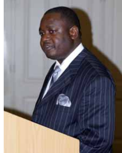
Hon. Peya Mushelenga

to a fishing company in Walvis Bay and to the state-of-the-art desalination facility north of Swakopmund. The workshop was generously funded and effectively co-organized by the Konrad Adenauer Foundation in Namibia.