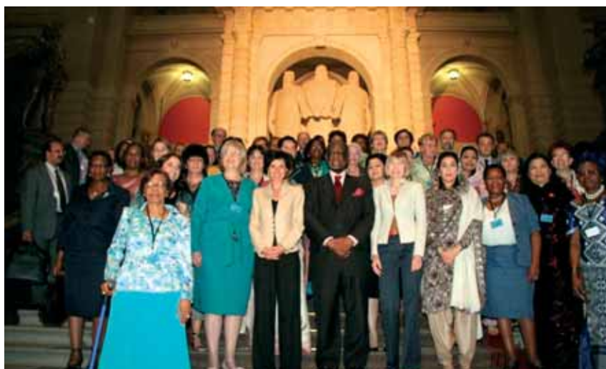
Dr. Gurirab (centre) at the official opening of the 6th Meeting of Women Speakers, held from 16-17 July 2010 in Berne, Switzerland.

This was my second such encounter. Once again, I benefited from their insights and vision for the future. Together the women Speakers share incredible experience, knowledge and insight into why countries have not made greater progress and what we need to focus our energy on. We are not lagging behind because the laws are not there. It is because we continue to live in male-oriented societies