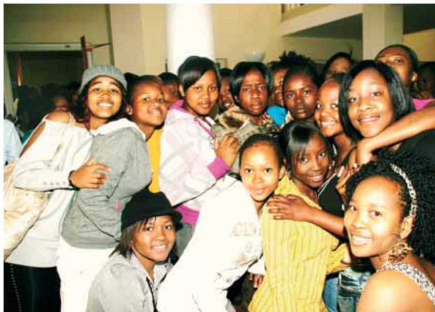
Students from South Africa's Harry Oppenheimer Agricultural High School in the Chamber of the National Assembly.

obeying the law, adding that "the people are very joyful." The learners visited famous sights in Windhoek, including the railway station, museum, Heroes Acre, Old Location and Parliament. Harry Oppenheimer Agricultural High School is a government school specialised in teaching mathematics, science and agriculture. It hosts learners from Grades 8-12. Six teachers and two parents accompanied the South African secondary school learners.