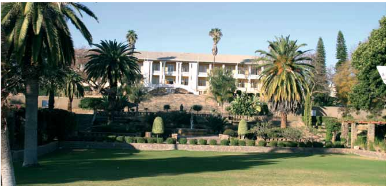
Between 1926 and beginning of November 1989, the “Tintenpalast” had been the seat of apartheid South Africa-appointed Legislative Assemblies.