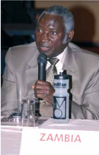
Hon. Amusaa Mwanamwambwa, Speaker of the National Assembly of Zambia.

upon Parliamentarians to continue supporting the fight against HIV and AIDS as the pandemic remains a poignant threat to citizens of the region.