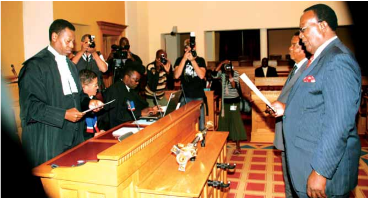
DTA President Katuutire Kaura (right) flanked by his party Vice-President Phillemon Moongo attracted media attention during their belated swearing-in ceremony.

Two parliamentarian-elects from the Democratic Turnhalle Alliance (DTA) were sworn in on 29 June 2010 as duly elected Members of the National Assembly. The Chief Justice Peter Shivute swore in party President Katuutire Kaura together with party