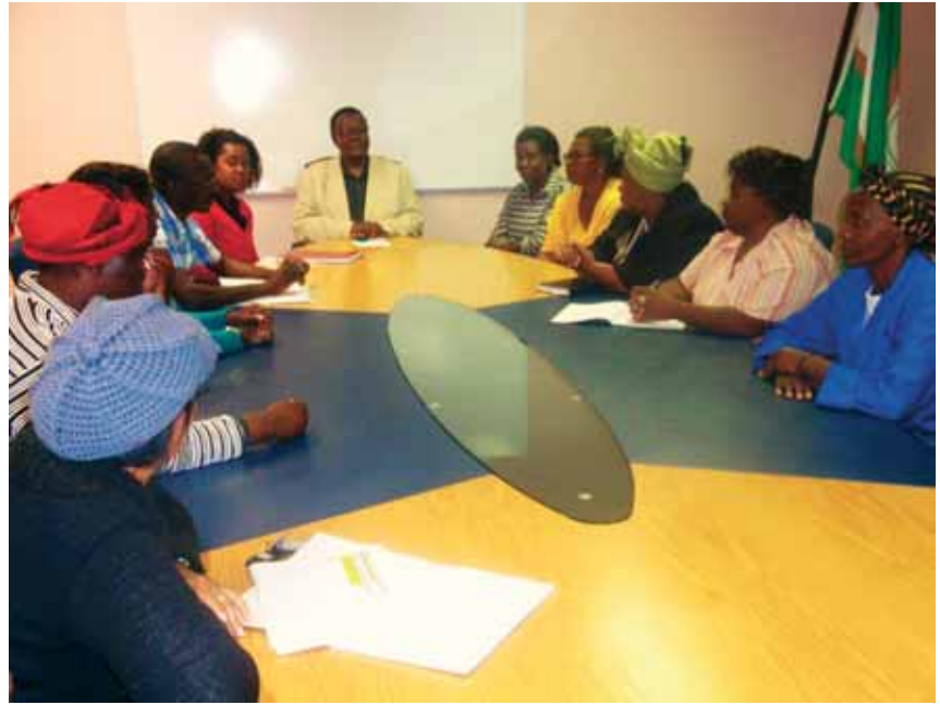
Hon. Asser Kapere in discussion with potential beneficiaries from the Erongo Micro Credit Scheme at the Arandis Constituency Office, 28 May 2010.

The Erongo Development Foundation, a charitable educational trust, was established in 1996 to address the