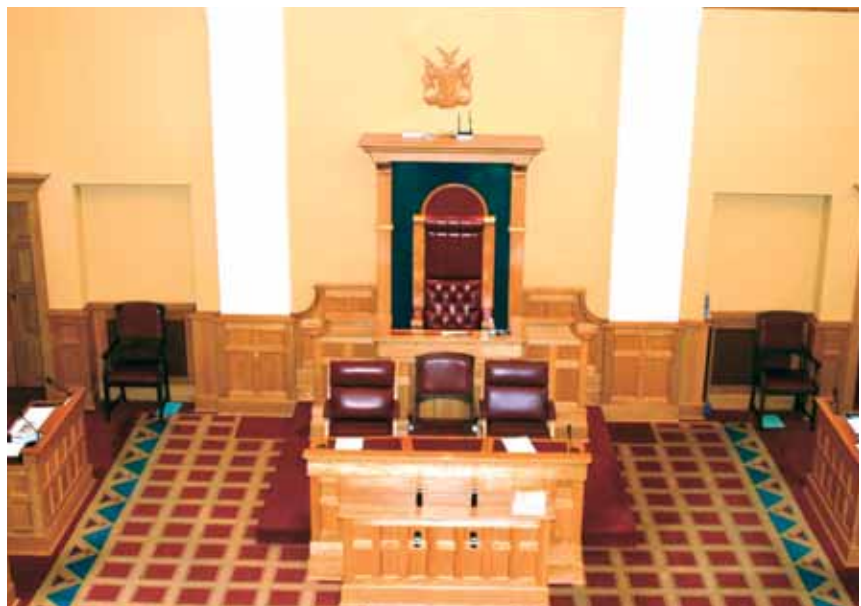
Chamber of the National Assembly