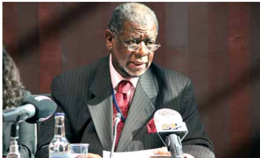
IPU President and Speaker of the National Assembly, Hon. Dr. Theo-Ben Gurirab, urging democratic institutions to resist temptation to trim down the rules of multiparty democracy.

Addressing the 3rd World Conference of Speakers of Parliament in Geneva, Switzerland, Dr. Gurirab said to achieve accountability, democratic institutions should be strong and resist the temptation to trim down the rules of multiparty democracy. He assured participants at the conference, held from 19 to 21 July 2010 and organised by the IPU, that public faith in parliament and how to improve the performance of the legislature according to basic democratic criteria was something that he would take very seriously. Dr. Gurirab's abridged speech follows below: