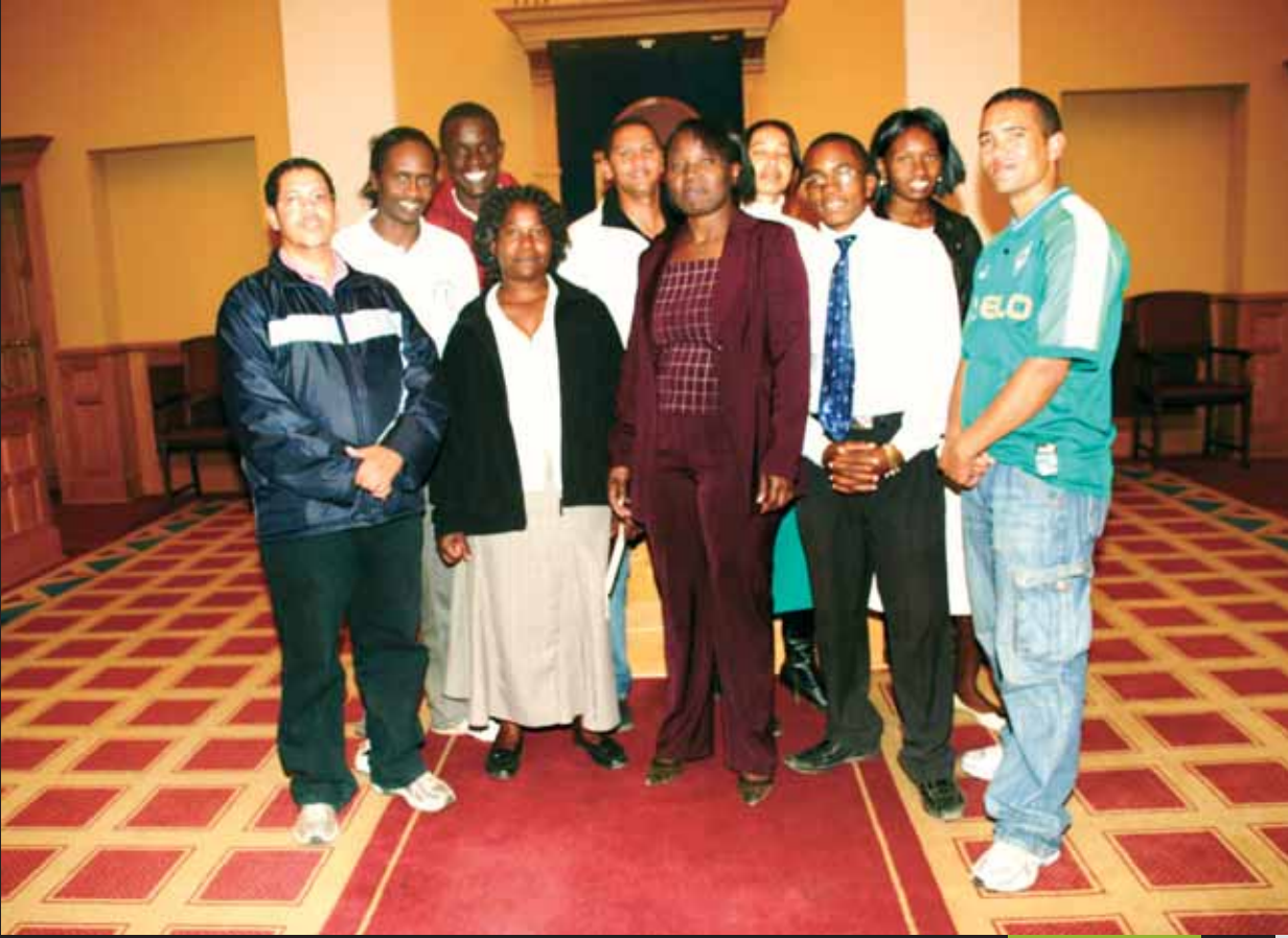
Students from Namibia Evangelical Theological Seminary toured parliament in July 2010.