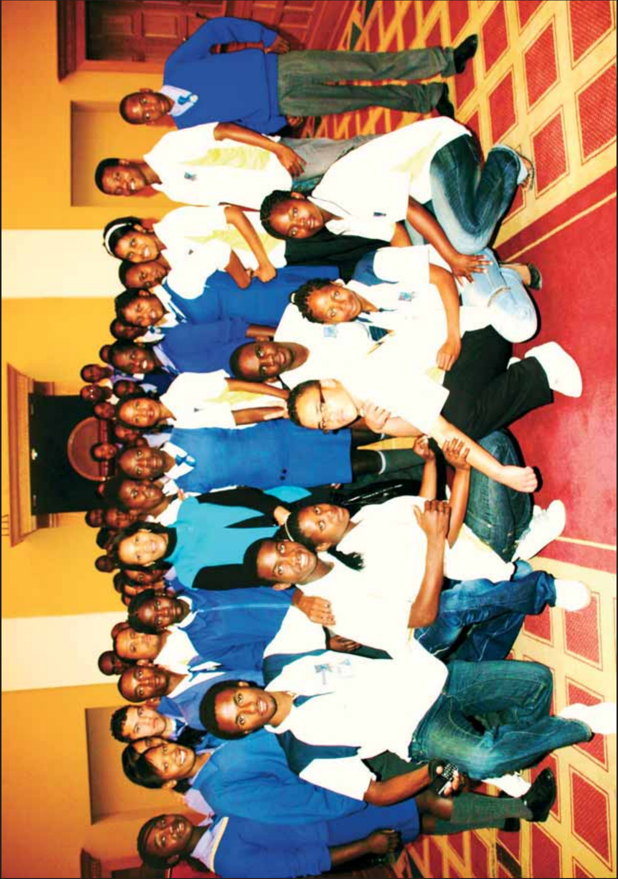
Gobabis' Wennie du Plessis Secondary School learners on a tour of Parliament, July 2010.