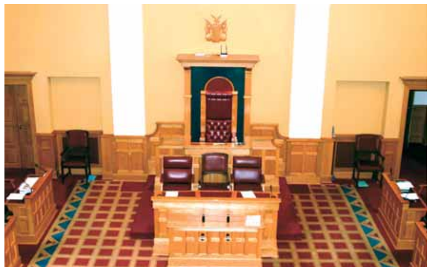
When the sponsoring minister introduces the bill in the National Assembly, it becomes public document.