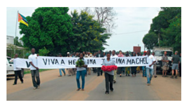
Participants at the day of action on the role of women in Mozambique

On the occasion of Women's Day in Mozambique, the association of civil society organisations GPAD and the Konrad-Adenauer-Stiftung held a day of action on 24 April in Gaza province on the role of women. The event included speeches by the district administrator and an eyewitness who reported on the life of a Mozambican women's rights activist. The Guitar and Chokwe civic organisations also provided information on their projects ranging from social issues to income-generating measures.