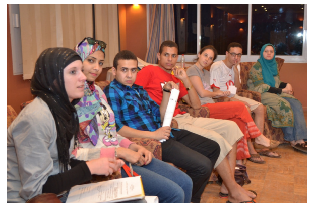
A form of group facilitation that invites to talk and to be creative is a new experience for young Egyptians.