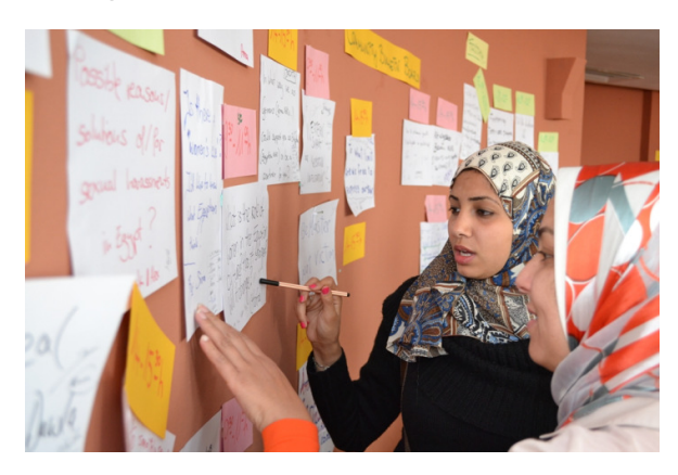
22 issues and many more ideas. Open Space also means keeping a clear overview.

Then, every participant had the opportunity to write down his/her topics of interest and announce them, together with a chosen time slot on the "Community Bulletin Board", a message wall set up specifically for this purpose. After the first round, the participants had defined 22 issues, to which more were added later. With every round of conversation sessions, the Breaking News Wall, located