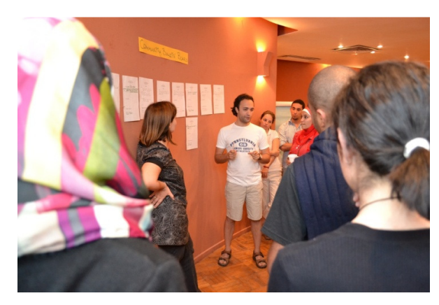
Discussion without dress code, another novelty in Egypt.

Analogue to the 'Model UN', Moataz wants to develop a 'Model Tahrir', representing and reflecting the positions of different political and social groups and associations in Egypt in a role play. Hala wants to use the idea in her work regarding women's rights: "Open Space is ideal for tackling taboo issues training gender equality, especially in Upper Egypt."