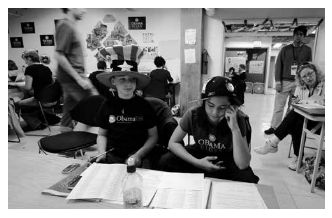
Young campaigners in Chicago: They are absolutely essential, but so are data and central coordination.