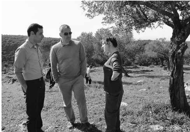
Members of the environmental NGO Society for the Protection of Nature in Israel on a visit in the Galilee.

over 130 NGOs from the environmental community, for instance organises an annual action day in the Knesset to enlist the support of Members of Parliament for legislation to benefit the environment and the climate. The largest environmental organisation, the Society for the Protection of Nature in Israel, is currently targeting local communities as local elections are due in autumn. Community action is crucial for effective environmental protection by not only implementing national policy but also demanding more far-reaching steps. These communities can also provide encouragement to the general public to engage in environmentally aware conduct. One example of this is the case of 15 self-governing cities coming together to form Forum 15 in 2008, which has attracted three further communities since then. These cities have put the implementation of climate protection targets as well as measures against air pollution on their agenda. 43