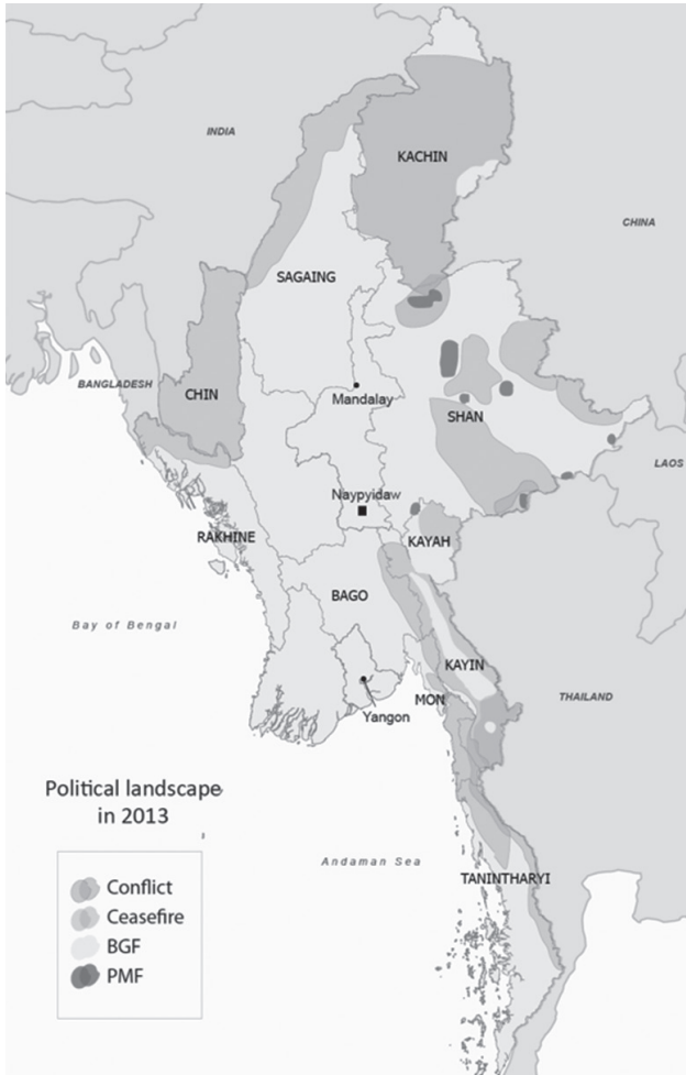
Map 1: Conflicts, Ceasefire, Border Guard Force and Peoples Militia Forces Areas, 2013.

Similarly, the conflict-affected areas in Shan State display high rates of poverty. This indicates a spatial correlation consistent with a negative spiral of poverty and conflict in Myanmar's ethnic minority States.