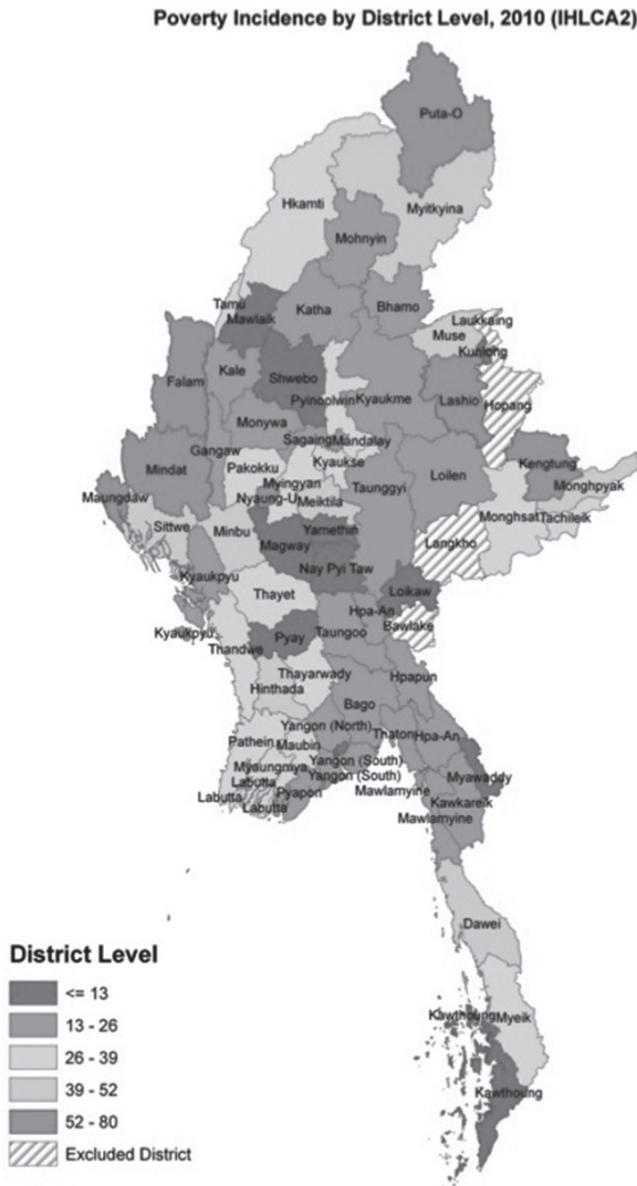
Map 2: Poverty Headcount by District, 2010.