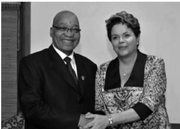
Close cooperation in the context of the BRICS and beyond: South African President Jacob Zuma and Brazil's President Dilma Rousseff.

The Brazilian government's growing interests in the South Atlantic also broadened within a stage featuring a rapidly changing cast of actors. Besides the coastal states, many of which have announced plans for, or are currently undertaking their own, seabed surveys in search of marine resources, some countries from outside the area have a noticeable presence in (or quick access to) the South Atlantic. The United Kingdom has a string of island territories stretching from the English Channel almost down to Antarctica, including not only the Malvinas/Falklands but also Mid-Atlantic Ridge islands such as Ascension and Saint Helena, which provide it with a military presence in the region. In 2008, the United States – which has access to the British string of islands through NATO – announced that it was reactivating its Fourth Fleet (which had been demobilised in 1950). Brazil's then Minister of Defense called the expansion of NATO forces in the South Atlantic "inappropriate," and the administration of President Dilma Rousseff continues to reject a broader role within the region by the alliance. The United States' ongoing "pivot" toward Asia and growing concern with China's rise and North Korean instability, however, suggest that its naval attention will be more focused on the Pacific.