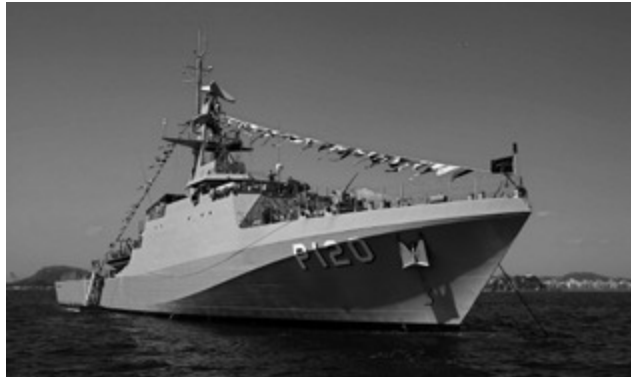
A new ship for the Brazilian Navy: The “Amazonas” was built in Great Britain and presented to the public in 2012.

vessel acquisitions but also ongoing cooperation with France for the development of a nuclear-powered attack submarine. Domestically, this modernisation project has been accompanied by a campaign entitled the “Blue Amazon,” aimed at mobilising popular support to the idea that Brazil has both vital resources and new security responsibilities in the South Atlantic. The new threats to national interests exploited in this campaign, which center on the notion that these resources give rise to greed by others, also help to structure key military exercises organised over the past few years. These include joint exercises such as IBSAMAR, the last one held with South Africa and India off the South African coast, as well as initiatives that include South American partners (e.g. ATLASUR, UNITAS). A number of the naval exercises simulate attacks targeting Brazilian offshore oil platforms in the South Atlantic.