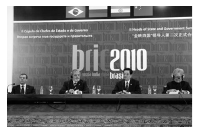
No more EU financial aid from bilateral geographic programs: The BRICS countries' foreign ministers, here at a meeting in New York then Heads of State on a BRIC summit in 2010.

this means that some 19 countries do not qualify any longer for bilateral aid allocations by geographic programs. This becomes reality for the so-called BRIC states<sup>20</sup> but will also affect countries such as Thailand or Peru.