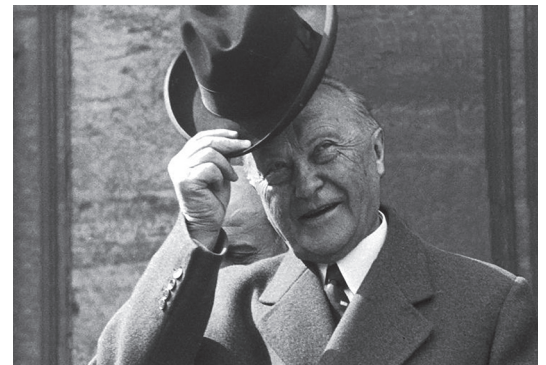
Konrad Adenauer, the first post-war Chancellor of Germany

We cooperate with governmental institutions, political parties, civil society organizations and handpicked elites, building strong partnerships along the way. In particular we seek to intensify political cooperation in the area of development at the national and international levels on the foundations of our objectives and values.