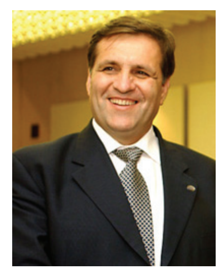
Boris Trajkovski, the Second President of the Republic of Macedonia

77.44% of the citizens registered in the voters' list.<sup>23</sup> One of the specifics of these elections was the fact that the State Election Commission invalidated a great many ballot papers – 130,820 votes were invalidated (12.41% of the ballot papers). Due to such a turn of events, the party Inner Macedonian Revolutionary Organization – Democratic Party for Macedonian National Unity (VMRO-DPMNE), which nominated Ljubisa Georgievski for president, submitted a complaint to the State Election Commission (SEC), demanding the elections to be cancelled. The complaint was overruled, which made Kiro Gligorov the first President of the Republic of Macedonia appointed on general and direct elections. Kiro Gligorov was the Chief of State until 19 November 1999.<sup>24</sup>