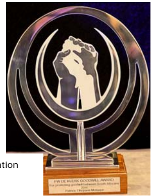
At a gala dinner the FW de Klerk Foundation gave its goodwill award for outstanding community engagement.