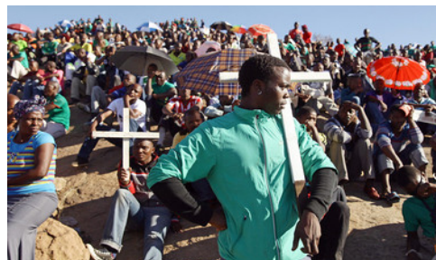
Striking mine workers at the Lonmin platinum mine near Marikana, © dpa.

The ongoing miners strike in the South African platinum belt has not yet reached the end. On 23 January 2014 70,000 mine workers downed their tools demanding a minimum wage of 12,500 Rand (about 875 EUR) per month. Mediation talks between the Association of