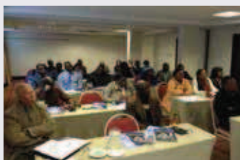
Participants at Social Media Workshop Safari Hotel, June 2014