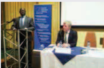
Honourable Isak Katali, Minister of Mines and Energy addressing the conference on Energy Security organised by KAS September 2014

The Swapo party held its electoral college on 30 August 2014 in Windhoek. The Electoral College is a meeting where the party draws up the list of candidates expected to represent it in the National Assembly. The announcement of the party's parliamentary list contains surprises with many of the so called 'trusted cadres' not making it high on the list. This has caused concern and unhappiness within the party as widely reported in the media. However, the party maintained that it was satisfied with the 'pot' outcome.