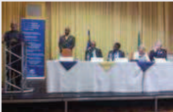
Honourable Andimba Toivo Ya Toivo addressing the audience at a lecture in his honour

Following its elective Congress held on 12 July 2014, the Republican Party (RP) announced that it will support Swapo's presidential candidate, Dr. Geingob during the upcoming National Elections in November 2014. However, Mr. Mudge, the re-elected party's president, insisted on making clear that the support was entirely to Dr. Geingob as a person and not to SWAPO and should SWAPO decide to change its candidate, they would reconsider their endorsement. Mr. Mudge said "We are not supporting a Swapo candidate. We are supporting Hage. If for any reason he is not the presidential candidate, we will withdraw our support, Mudge told the Namibian Sun". Mr. Mudge has made a u-turn and withdrew his endorsement of Hage. He is now standing as a presidential candidate for his party.