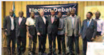
KAS with party leaders, June 2014

As a follow-up on this meeting, on 25 June, KAS invited the press to a presentation on the KAS MEDIA Programme at Safari Hotel. The KAS Media Programme is based in Johannesburg and offers the following opportunities: Scholarships, training, networking and offer expertise on media issues.