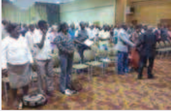
Audience welcoming Honourable Andimba Toivo Ya Toivo at the Public Lecture hosted by KAS in his Honour in Windhoek