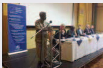
Honourable Ben Amadhila, (MP) addressing the audience on Energy Security 2014.

The EU-KAS sponsored project implemented by Women's Action for Development (WAD) called "My Rights as a Women and Namibian Citizen! Gender and Human Rights Awareness Raising" has successfully concluded on 31 July 2014. The project launched 3 years ago with an estimated budget of N$6 million, had as its main goal to contribute to a gender sensitive Namibian society where human rights are respected and women enjoy equal opportunities. The project trained more than 20 000 Namibians in all 14 regions. It received support from the Ministry of Gender Equality and Child Welfare (MGECW), the Legal Assistance Centre (LAC) and UNAM Law Faculty.