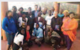
KAS with party representatives at a workshop outside Windhoek, July 2014

In the second debate, 7 parties took part and the focus was on the "recent South African Elections: Lessons for Namibia". The party leaders were invited to lay out their agenda for the country after the national polls if their party were to (re-)gain power after the elections on 28 November 2014. The debate was informative, educational and proved very popular among the participants. The reports of the two debates are available on our website at: www.kas.de/namibia