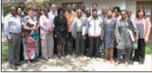
MPs and staff at Parliamentary Oversight of Development Aid Workshop (February 2014)

KAS Outreach Programme to the Region donating books to a school in Khorixas