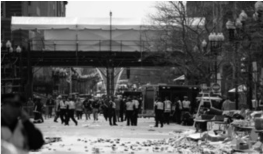
Export of terror: The assassins of the attack on the Boston Marathon in April 2013 were of Chechen origin. The crisis regions on Europe’s edges provide fertile ground for terrorism.

As the campaign of the international coalition against Daesh puts growing pressure on the organisation in Syria and Iraq, the number of German returnees is likely to grow, raising the probability of both “Lone Wolf” attacks – typically involving stabbings, shootings, car-rampage attacks, or Boston-Marathon style bombings – as well as more organised strikes by sleeper-cells.