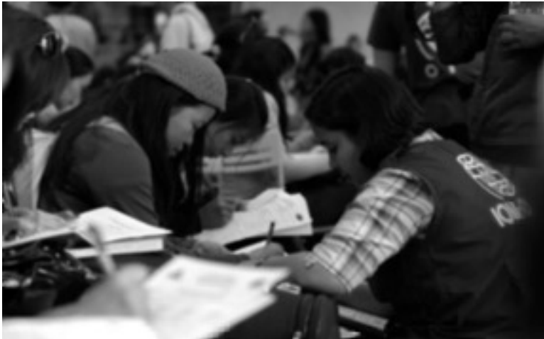
Concern about returnees: Crises in host countries cause working migrants to return. The International Organization for Migration provides help.

These positive signals fly in the face of reports that embassy staff are generally inadequately trained and equipped to deal with the many cases of abuse and human trafficking. For example, in the first six months of 2013, the Philippine Overseas Labour Office in Qatar had to find shelter for over 600 domestic workers who had fled from their employers. 38 So it is still vital that embassies continue to provide advice and training, firstly to raise the awareness of government, airport, port and police personnel in this respect, and secondly to be able to take action in cases of dire need. In future, this advice and training should also be provided in the Philippines.