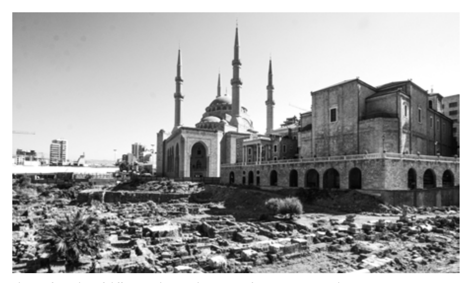
Places of worship of different religions shape Beirut's cityscape up to this day. They reflect Lebanon's religious diversity.

Lebanon's story was very different. Here, Ottoman group particularism was not overcome but elevated to the organisational principle behind the state after it gained independence in 1943. In light of a blockade between supporters of independence and supporters of a union with Syria, the two sides agreed to the National Pact, which remains in place today. This agreed that the sovereign state of Lebanon should be set up, that there should be no union with Syria, that France should not be a protective power and that there should be no military alliance with the West. Lebanon was set up as a consociational democracy without majority rule, based on 18 recognised religious communities (Sunnis, Sevener and Twelver Shiites, Druze, Alawites, Jews and twelve Christian religious denominations). Parliamentary seats, furthermore the highest governmental positions and many other posts were allocated according to a set ratio of 6:5 in favour of Christians. To some extent, the constitution was a continuation of the Ottoman millet system, but the Sunnis were no longer afforded their previous privileges. The absence of a parliamentary majority and special constitutional provisions necessarily led to consociationalism. Syria viewed Lebanon's independence as a neocolonial manoeuvre on the part of France, and indeed only recognised its independence in 2008.13