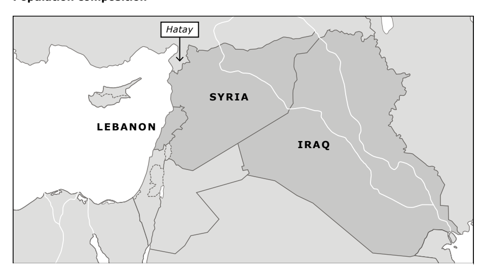
Fig. 1 Population composition

The Arab world followed a different pattern. With the exception of Morocco, the Arabian Peninsula and Oman, this region was formerly part of the Ottoman Empire. The provinces of Beirut, Aleppo, Damascus, Mosul, Baghdad and Basra were the predecessors of today's Lebanon, Syria and Iraq. They are extremely diverse in ethnic, religious and tribal terms and have strong, overlapping group identities.