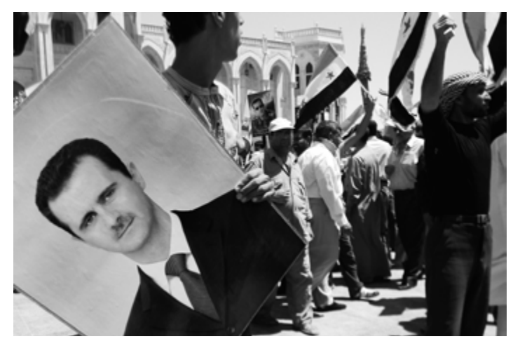
Bashar al-Assad (photo) as well as Saddam Hussein secured their power through the establishment of a ruling clique and the co-opting of religious minorities, economic interest groups and tribes.

The clearest and perhaps most painful manifestation of the crypto-confessionalist nature of the system could be found in the security forces and secret services. In Syria, their leaders and elite units came from the Alawite minority, in Iraq they were recruited from the Sunni minority.