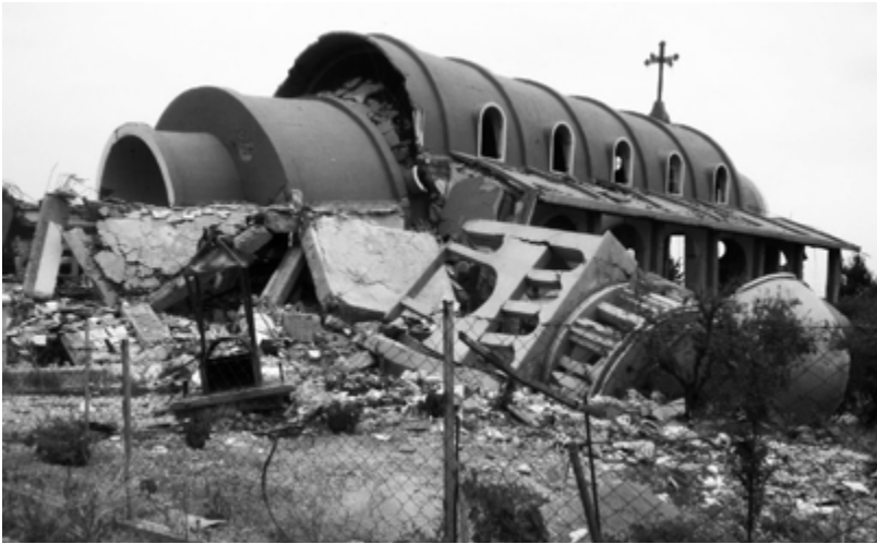
A destroyed Assyrian church in the Khabur area: The trust of the Christian population in the Peshmerga troupe wanes, as they are unable to maintain permanent protection against the IS.