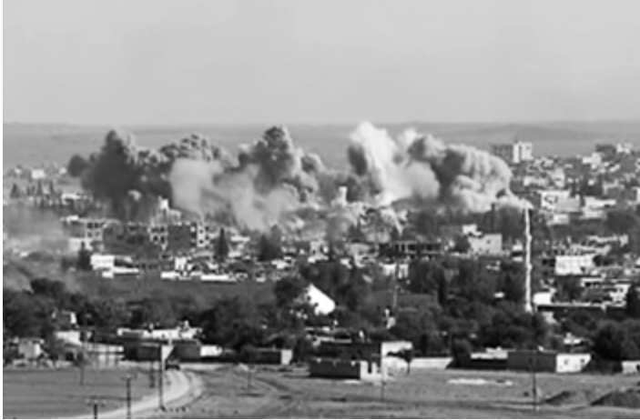
An attack of the anti-IS Coalition in Kobani: The setback moved the IS to attack other targets.

does not mean the situation has stabilised by any means and the Christians can return. On 5 April 2015, for instance, IS blew up the Church of the Virgin Mary in Tel Nasri, when YPG fighters and Christian militiamen attempted to recapture the village. 34