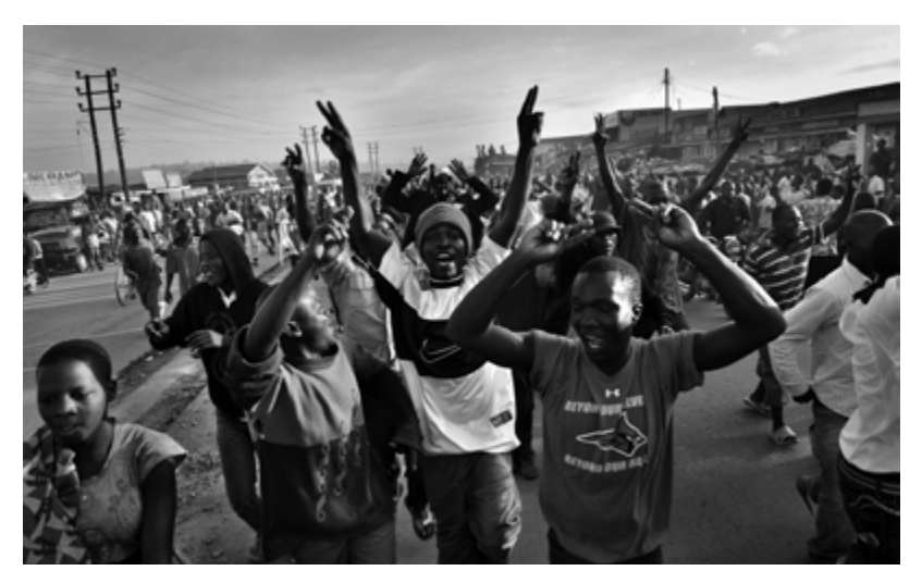
The "Walk to Work" campaign protested against rising petrol prices in 2011. The protest degenerated into rampages leaving several people dead and numerous injured.

Notwithstanding this state of affairs, an unprecedented diversity of opinion and information has been developing in the publicly accessible digital sphere in Sub-Saharan Africa over recent years. However, this diversity is to be found not so much on the websites of established media brands but instead in blogs and social networks. The Arab Spring in North Africa suddenly brought home the effect the latter can have on political processes. Even if the phrase "social media revolution" is ultimately not applicable to the upheavals in the Maghreb, social media undoubtedly played a role in the rapid proliferation of information and in the protestors' efforts to organise. This potential has now also expanded to the region south of the Sahara.<sup>11</sup>