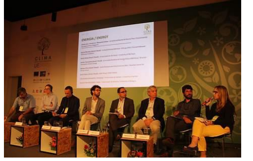
After the presentations, the audience had the opportunity to ask questions and make comments.

"Climate Change, We're All Responsible", an event organized by the European Union Delegation in Brazil, WWF-Brazil and Planetarium Foundation Rio de Janeiro was supported by the Konrad Adenauer Foundation, which was responsible for organizing the panel discussions on Renewable Energy and Energy Efficiency. <u>Read more...</u>