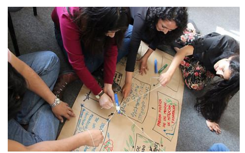
Group dynamic on INDCs.

From August 24th to 29th, Lima hosted the International Seminar Ambassadors +1, where young people from Latin America and the Caribbean generated a position in the context of National Contributions and the new climate agreement, as well as a plan of action to promote further commitments and climate actions on the threshold of the COP21 in Paris. <u>Read more...</u>