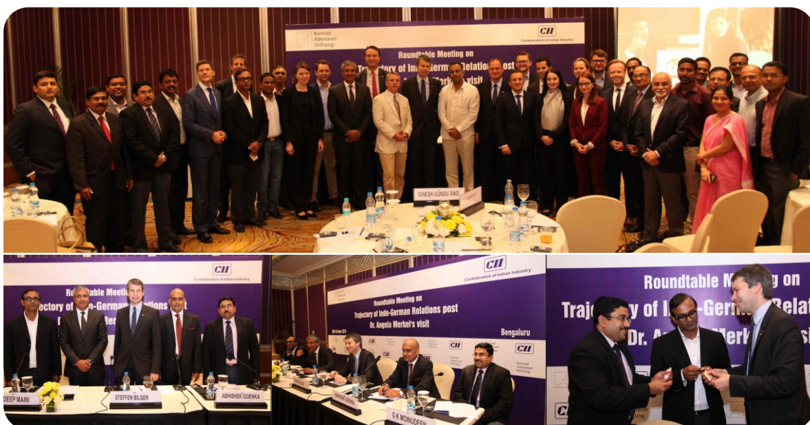
Round table meeting on Trajectory of Indo-German Relations with Parliamentarians from India and Germany & Leaders of the Indian Industry on 28th October 2015 in Bengaluru