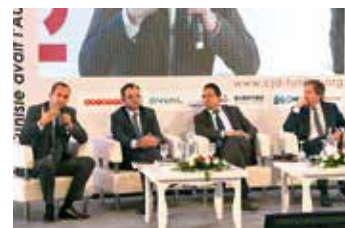
Under cross-examination by the generation of young entrepreneurs: Development Minister Brahim, Finance Minister Chaker and Employment Minister Ladhari with the Portuguese Ambassador Pedro Lourtie

With its annual congress Tunis in December 2015, the Tunisian association for young entrepreneurs (CJD) rounded off a successful year.