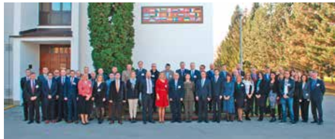
Participants of the RACVIAC security conference