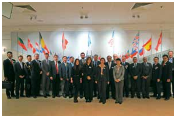
Group photograph of the members of the fifth NATO-Asia/Pacific Dialogue

The event began with consultations and discussion at the NATO Headquarters in Brussels. On the second day, the delegation visited the European Defence Summit of the Munich Security Conference. The event concluded with a conference on NATO's future engagement with Asian partners. Topics of particular interest included hybrid warfare, cyber security, maritime security, the Ukraine crisis with its implications for Asia, crisis prevention and management, and