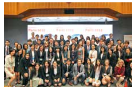
International students simulate the COP21 negotiations in Hong Kong

In autumn 2015, some students and young professionals who are the future decision-makers in politics and business learnt about the challenges of global climate policy during a COP21 simulation game lasting several days, which the KAS Regional Project Energy Security and Climate Change Asia-Pacific (RECAP) had organised. The negotiation simulation involved the national contributions to emissions reduction and the adaptation to climate change. The joint outcome document contained concrete goals and coordinated measures that came very close to the actual results of the Paris negotiations in December. Many of the students intend to use the specialist knowledge and negotiating skills they acquired for their future work.