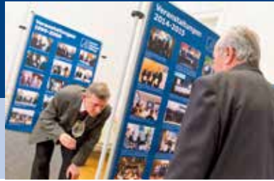
Top right: An exhibition was held to accompany the symposium, displaying images covering the last 25 years.