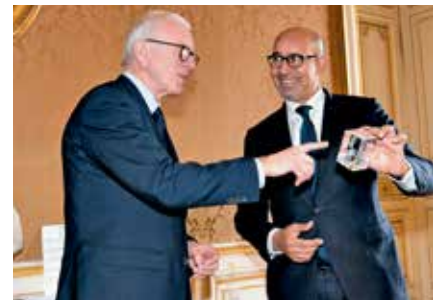
Dr Hans-Gert Pöttering (Chairman of the Konrad-Adenauer-Stiftung and former President of the European Parliament) with his host Harlem Désir, French Secretary of State for European Affairs