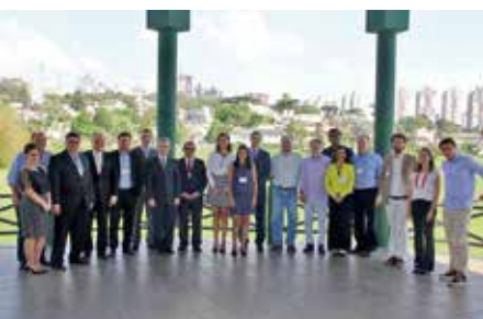
Participants in Barigui-Park, Curitiba

In collaboration with the city of Curitiba, the KAS Brazil office organised a meeting of the National Forum of the Heads of the Departments for Environmental Affairs of the capitals of the Brazilian federal states (CB27). The participants discussed the role of subnational actors in climate policy negotiations and decision-making, as the decisions made at a national and international level have a direct impact on cities. The secretaries of the environment attending the meeting signed a declaration of intent stressing the need to create a regulatory framework on emissions reduction for the capitals of the federal states, and to specify the financial and technical means required to limit global warming. The participants also agreed that a delegation of the CB27 would be sent to attend the COP21 in Paris.