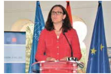
EU Commissioner Cecilia Malmström discussed plans for a new free trade agreement with Tunisia at a KAS conference in Tunis.