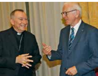
Secretary of State Cardinal Pietro Parolin after the meeting with Dr Hans-Gert Pöttering (Chairman of the Konrad-Adenauer-Stiftung and former President of the European Parliament) in the Vatican

The role played by the Catholic Church in dealing with the refugee crisis in Europe was at the centre of meetings conducted by the Chairman of the Konrad-Adenauer-Stiftung and former president of the European Parliament, Dr Hans-Gert Pöttering, in Rome from 31 October to 1 November 2015. Besides Vatican Secretary of State Cardinal Pietro Parolin, he met with the secretary for relations with states, Paul