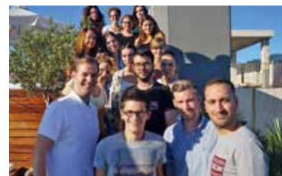
The participants of the Athens workshop

In September 2015, the Greek-German journalists' workshop "dialoggers" took place for the fifth time, bringing together twelve young journalists from the two countries in Athens to engage in some joint research. In bi-national teams, current issues from politics, society, business and culture were examined. The results were documented on the www.dialoggers.eu blog site. The close co-