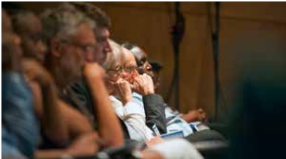
The audience is listening attentively to contributions from the floor

Against the backdrop of strikes in South Africa that are increasingly threatening to boil over into violence, the KAS and its partner, the Mail & Guardian weekly newspaper, organised a podium discussion in December 2015 about jobs and prosperity. In a country that has the highest number of strike days in the world, collective bargaining within a functioning framework