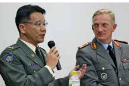
Colonel Kenichi Igawa (left) and Brigadier General Jürgen-Joachim von Sandrart

While it became clear that the causes of terrorism are numerous and complex, the discussion indicated that poverty and poor education or a deficient education system were among the key factors. These cannot be overcome by military means alone; instead, there is a need for concepts of effective and sustainable development to reduce and eliminate the causes of terrorism and violence.