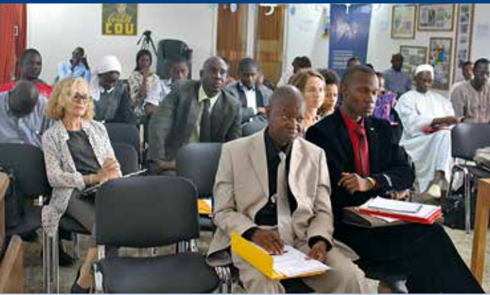
Expert audience of the seminar on the fight against terrorism