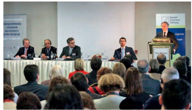
Conference "Transparency and open government to combat corruption"

Since 2010, within the scope of the annual project "Leaders for Justice", the Rule of Law Programme in South-East Europe has helped train particularly well-qualified junior jurists from Romania, who have the potential to play a leading role in strengthening the democratic, constitutional state and building a judiciary that is transparent and ethically responsible. The programme is founded on the knowledge that sustainable reform of the judiciary is heavily dependent on the availability of a new judicial elite, whose members have not only adopted the principles of the rule of law but are also prepared to act as multipliers and do everything necessary to apply these principles to the judicial system.