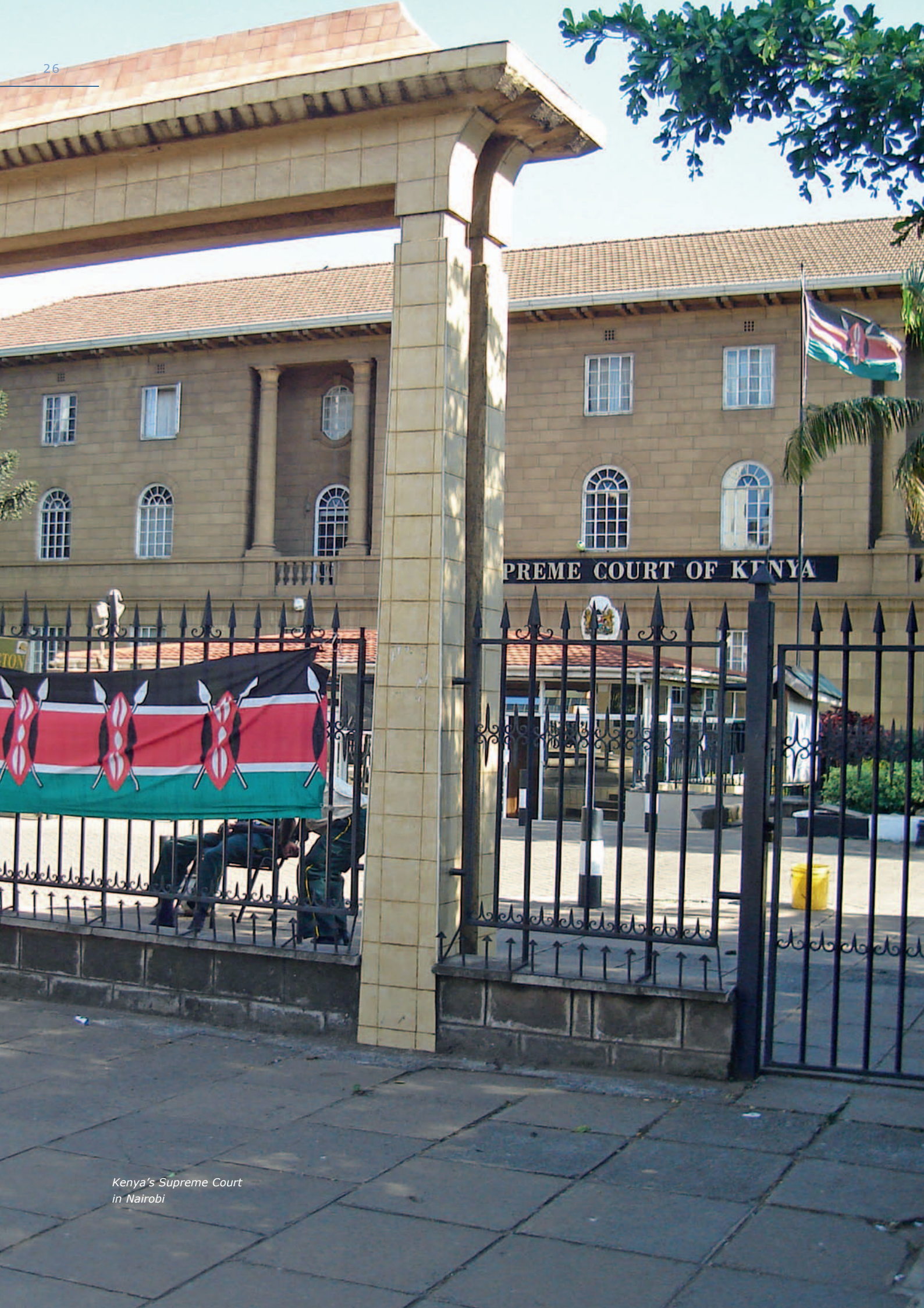
Kenya's Supreme Court in Nairobi