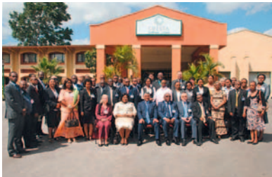
Human rights conference in Zambia

The Western interpretation of the concept of the rule of law has no roots in the traditions of Sub-Saharan Africa and thus often only plays a minor role in political culture. There are, however, a number of political, administrative, civil society and above all judicial actors who are interested in the rule of law and are committed to promoting and establishing it in the region. The KAS worldwide Rule of Law Programme's sub-programme in Sub-Saharan Africa aims to provide this group of people with support and encourage others to join their ranks.