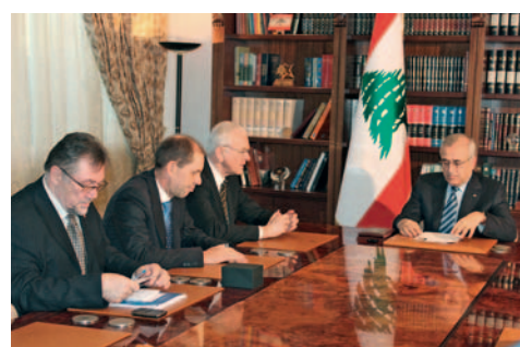
The Chairman of the KAS, Dr Hans-Gert Pöttering, used his visit to Lebanon to conduct political talks with the president, General Michel Sleiman (r.).

Legal culture: In many states in the region, there is evidence of considerable distrust of the legal system and its institutions. Political, religious, social and familial authorities grant and also revoke personal security, individual freedoms and access to resources on a more or less arbitrary basis. Those affected often fail to make use of judicial procedures to assert their basic rights due to fear, powerlessness and ignorance. Citizens in these states often fail to see a direct connection between democracy and the rule of law. The foundation's work on the rule of law therefore also strives to establish and raise the profile of this connection, specifically in the Arab-Muslim context.