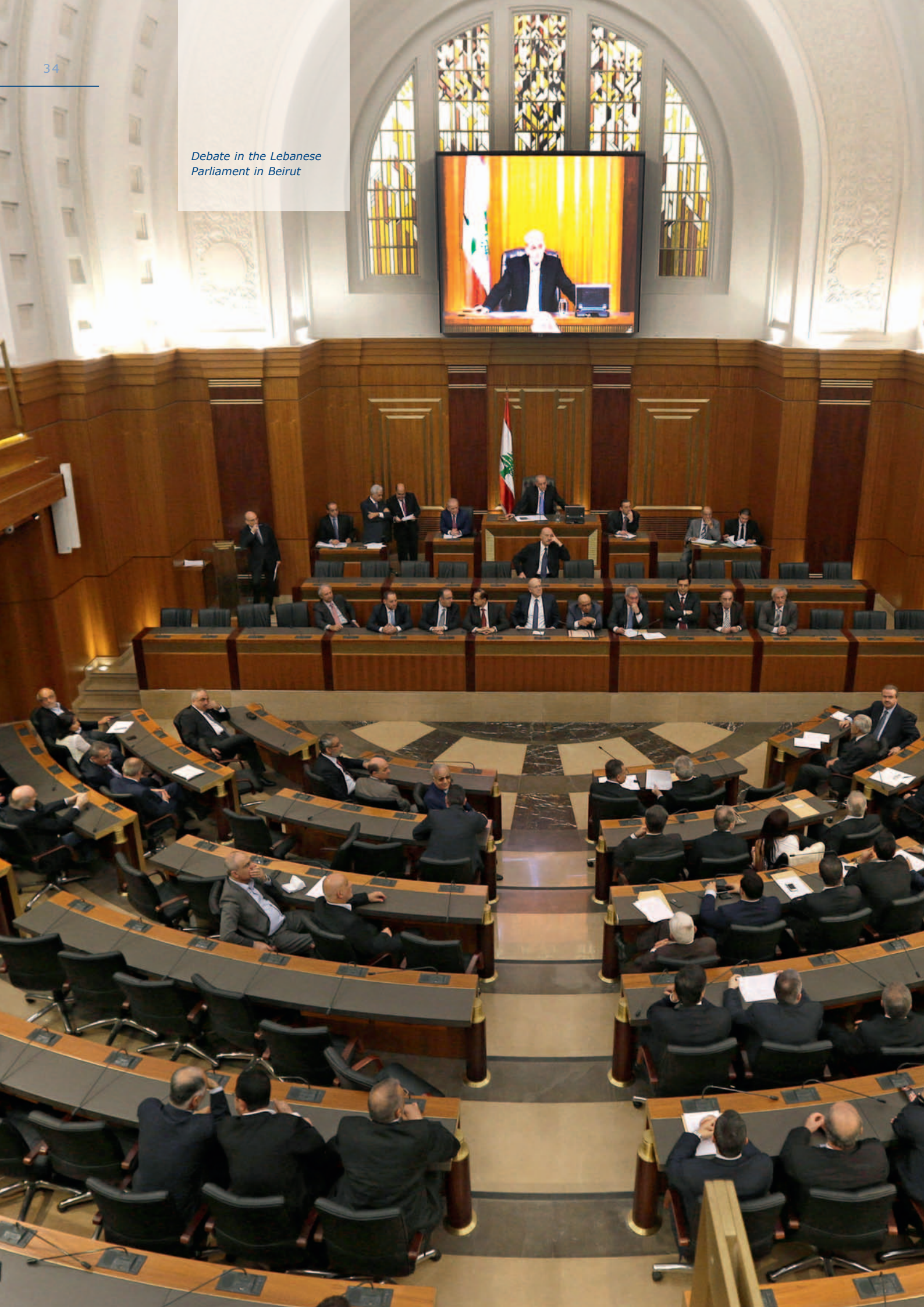
Debate in the Lebanese Parliament in Beirut