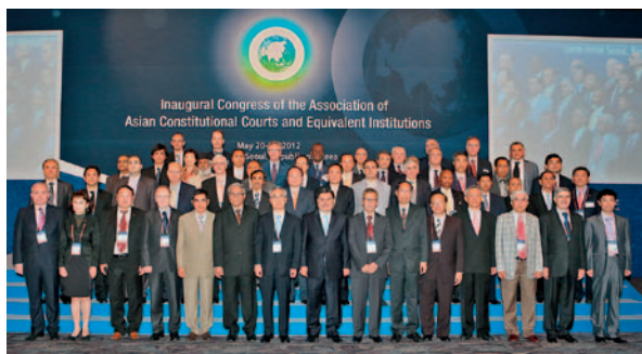
Congress of the Association of Asian Constitutional Courts and Equivalent Institutions (AACC) – constitutional judges from Asia, Africa and Europe in Seoul discuss the significance of constitutional courts for the development of democracy.

In summary, it is clear that Asian countries are indeed seeking practicable methods that would allow them to respond to calls for the rule of law from other regions of the world, while simultaneously protecting unique national characteristics – even if, in some cases, this is simply to preserve the power of the ruling class or party. Alongside the race to modernise and internationalise economic systems, there are, however, still grave deficits with regard to controls on state power. Even where the foundations of the rule of law have been laid within constitutional texts, reality tells a very different story. A state’s constitution is still not viewed as a basic law which determines what action can be taken and which binds all state organs and each and every citizen to this order. In the majority of Asian countries, the principle of constitutionalism has yet to be established and internalised.