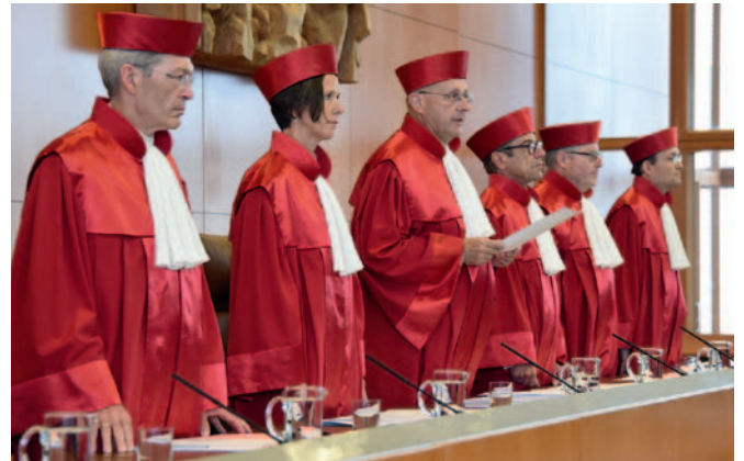
German Federal Constitutional Court judges in Karlsruhe

In their pursuit of social, political and legal stability, many countries across all continents not only wish to gain knowledge of German constitutional law, namely the law of basic rights and state law, but also of German electoral law, political party law, criminal law and the law of criminal procedure, civil law and the law of civil procedure, or administrative law and the law of administrative procedure. They wish to understand how administrations operate under the rule of law – specifically with regard to courts that have binding jurisdiction over the administration.