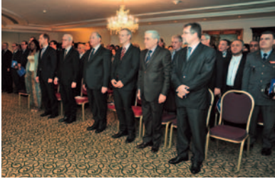
Official opening of the Regional Rule of Law Programme in the Middle East/North Africa and the Konrad-Adenauer-Stiftung's Lebanon Office in Beirut

The Rule of Law Programme in the Middle East/North Africa comprises three sub-regions. All of the countries in the programme are undergoing transition processes and are similar in some respects, while differing greatly in others. North Africa (the Maghreb) is marked by the French legal tradition and still influenced by the French language and French politics. The Levant and the Mashreq comprise the Palestinian territories, Jordan and Lebanon (as well as Syria and Iraq). There are also specific parallels in these states in historical, political and legal terms. Egypt is viewed as part of the Mashreq. The Gulf States (apart from Yemen), last of all, have achieved the highest level of cooperation in the region and share a number of legal policy structures and experiences.