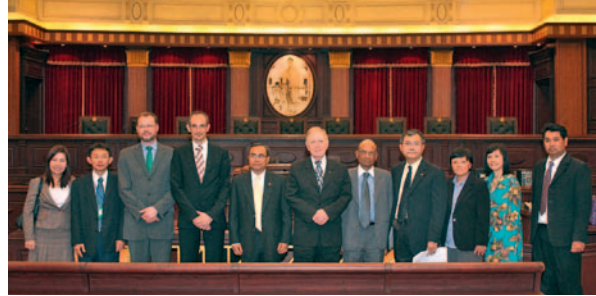
The ethics of being a judge and fighting corruption – at the invitation of Thailand’s Supreme Court in Bangkok, high-ranking jurists exchange experiences on the specific challenges facing the judiciary in the battle against corruption.

Moreover, a lack of institutions based on the rule of law – above all, an independent judiciary – and secure procedures for law enforcement continue to render democratisation processes susceptible to authoritarian backlash.