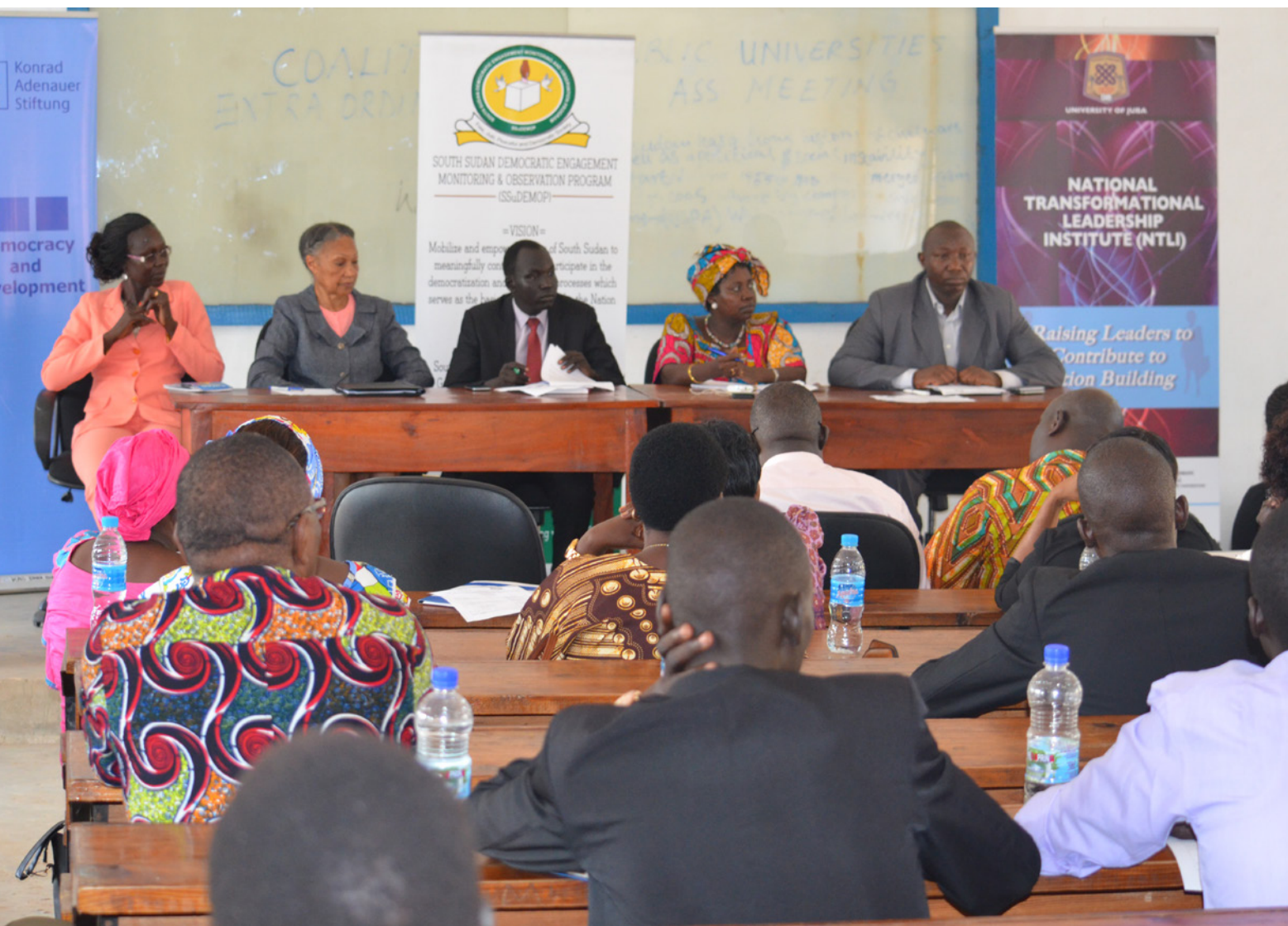
Public dialogue on the role of women in nurturing democracy and democratization processes in South Sudan held at the University of Juba under the auspices of SSuDEMOP, KAS and the University of Juba's National Transformational Leadership Institute (NTLI).