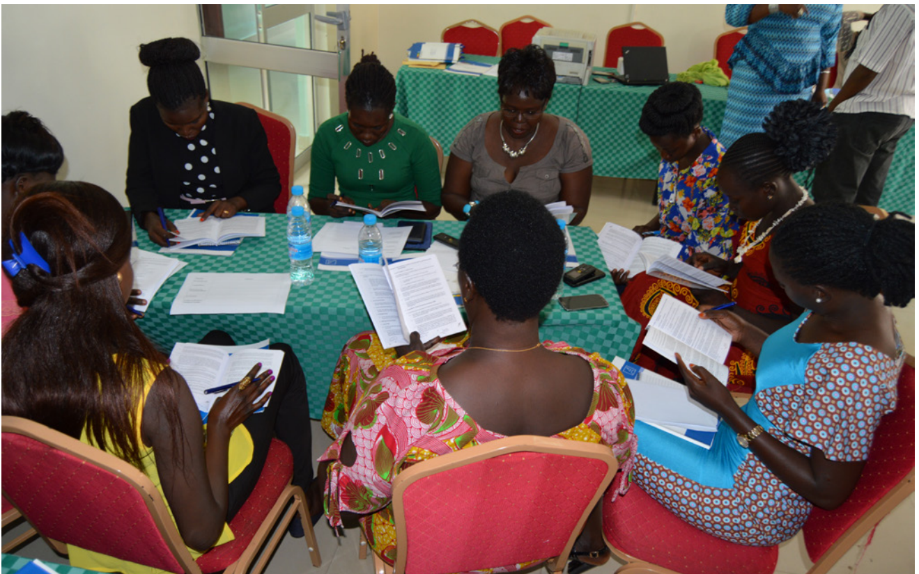
Participants during the women's strategy development workshop discussing the opportunities for women within the Peace Agreement; ARCSS-2015