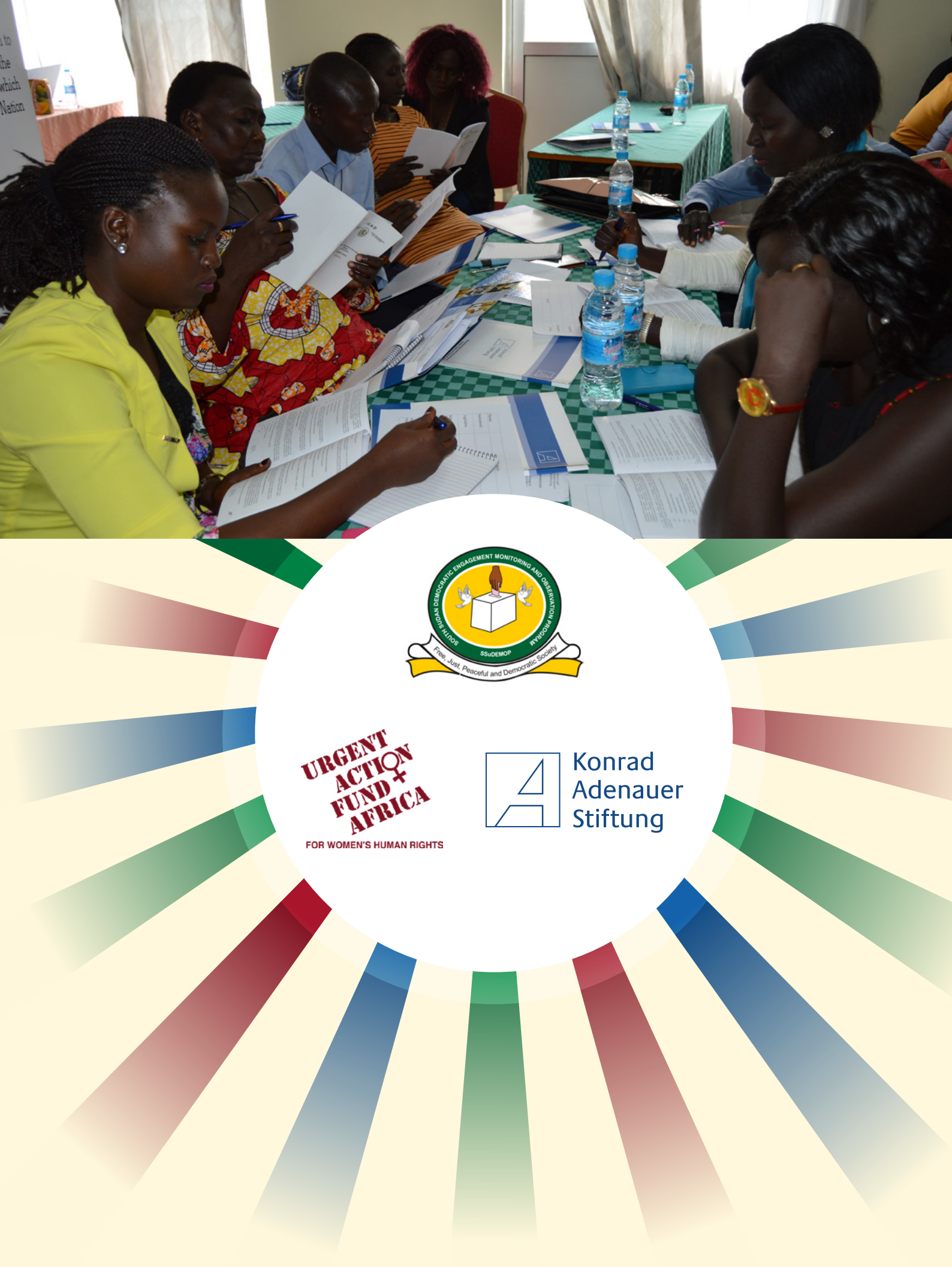
This partnership has produced meaning and value.