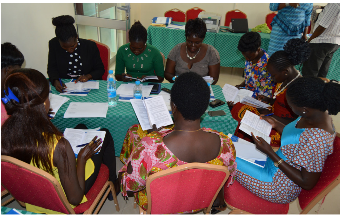
Participants\ during\ the\ women's\ strategy\ development\ workshop\ discussing\ the\ opportunities\ for\ women\ within\ the\ Peace\ Agreement;\ ARCSS-2015