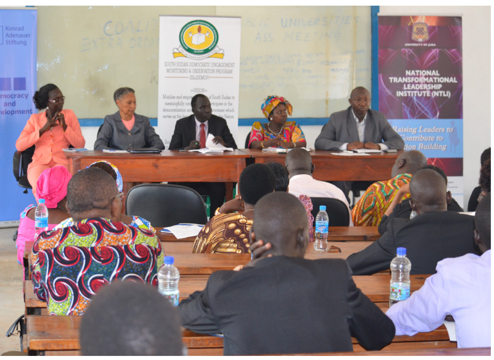
Public dialogue on the role of women in nurturing democracy and democratization processes in South Sudan held at the University of Juba under the auspices of SSuDEMOP, KAS and the University of Juba's National Transformational Leadership Institute (NTLI).