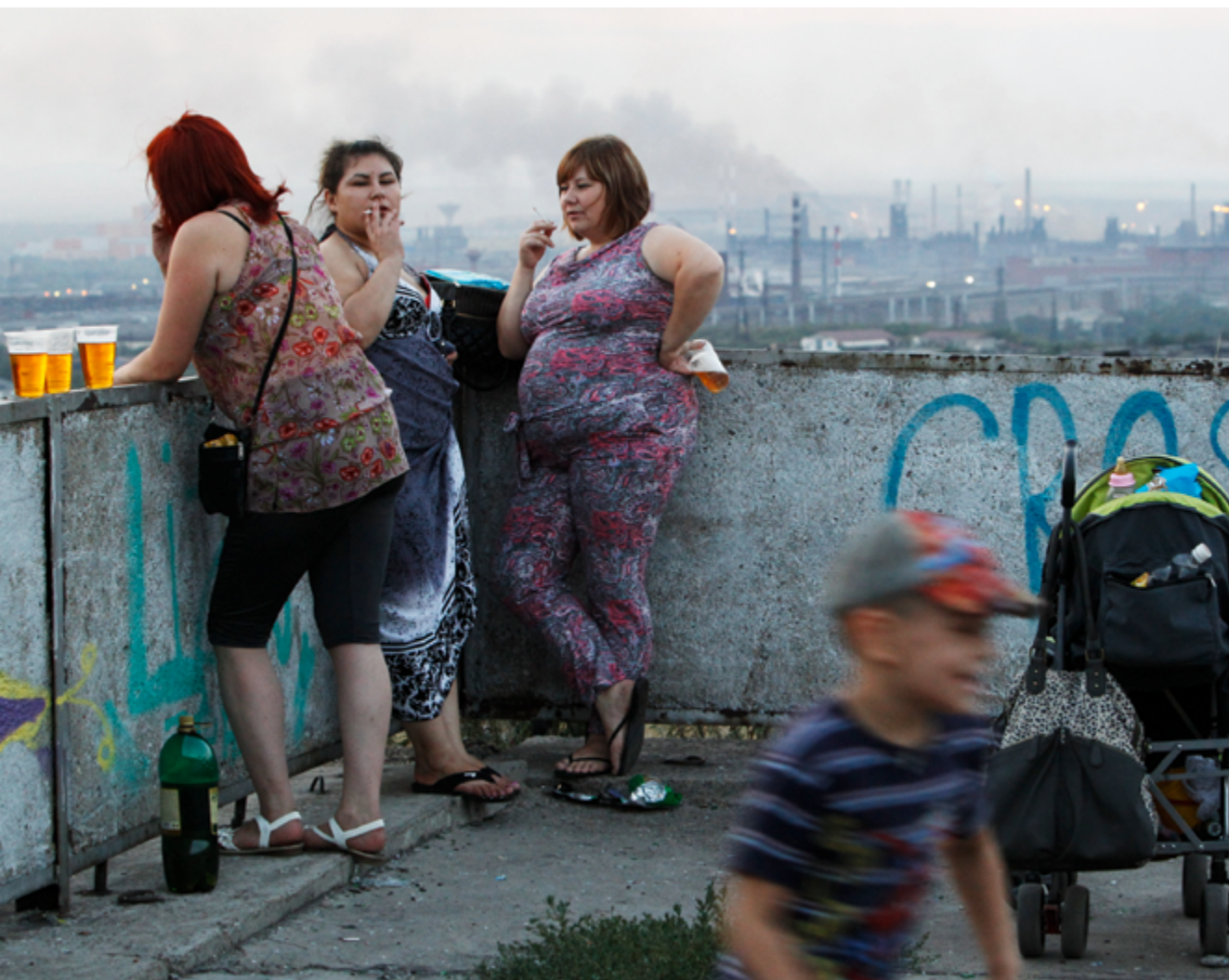
Left behind: The number of Russians living below the poverty line has increased by nearly four million between 2013 and 2015 alone.

that it has experienced since the collapse of the Soviet Union. As the successor to the USSR, Russia retains its seat on the UN Security Council, but this has often failed to have a political effect. It was also affected by the major economic decline under President Boris Yeltsin in the 1990s, which was felt as a humiliation, even though the West was not responsible for this difficult economic situation. However, hoped-for debt relief from the West was not forthcoming, and the liberal government under Mikhail Kasjanov (May 2000 to February 2004) felt that it had been left in the lurch.