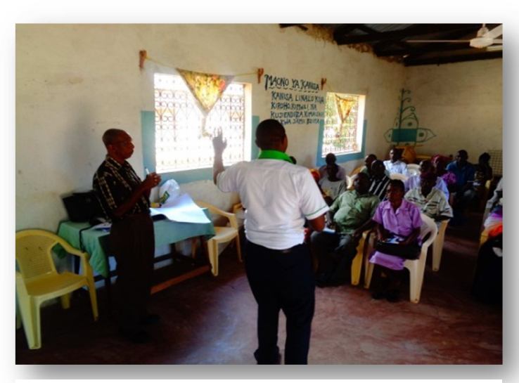
Introduction of Project Team to the Community at Mtondia Dispensary by the Area Administrator \,