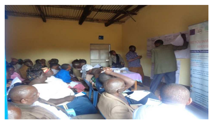
Citizens of Kaunguni Sub-ward in Makueni County participating in community scorecard focusing on Health sector

Finally, as we approach the forth coming general elections, lets us remember that we are born with immense reservoirs of energy and faculties to get us what we want in life. The powers inherent in us are inexhaustible and we MUST exploit them for the benefit of our counties and our beloved nation KENYA. It