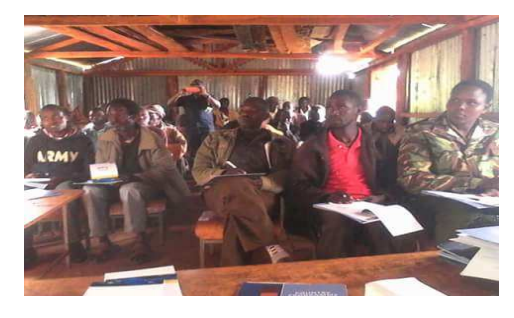
Community sensitization forum on Scorecard Methodology as means of enhancing service delivery held at West Pokot County, Kapchebar Health Centre on 11th August 2016

process in which community members and service providers together discuss their impressions and work together to improve how services are delivered. CSCs are targeted around specific services and so work best at a local level, where the 'community' and the service being evaluated can be fairly well defined. Services and projects that might be included in this are local health centres, local schools, administrative units, or projects that have a specific target community<sup>2</sup>. For our case, we chose to pick on health services and therefore focused on health services facilities.