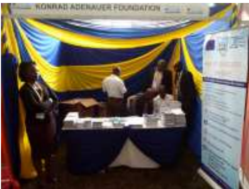
Meru National Polytechnic in Meru County from 19. - 22. April 2016

During the Conference we had an opportunity to present a policy paper called “Walking through the Journey of Devolution” to Governors and Deputy Governors who assured their support for the EU-Co-funded Project. This paper mentioned clearly the status of implementation of Devolution in Kenya and mentioned risks, challenges, achievements and provided suggestions for the same.