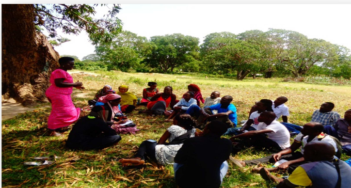
Youth discussing Community Scorecard at Ganda

The stakeholders in the project implementation are satisfied with the approach of engagement and partnership rather than confrontation that has been the case with many civil society organizations. The engagement has ensured efficient and effective application of scorecard by Citizen Oversight Forums (COFs) for health performance assessments and most importantly the support and willingness to partner together from the county leadership, a key stakeholder for the PTD project.