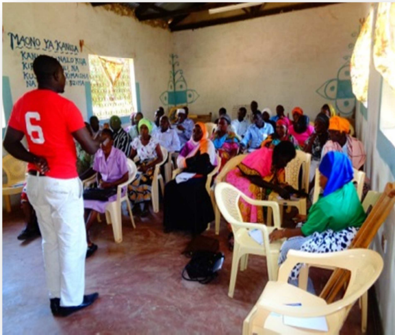
Community Awareness Forum at Mtondia Village

Kenya Conference of Catholic Bishops - Catholic Justice and Peace Commission.