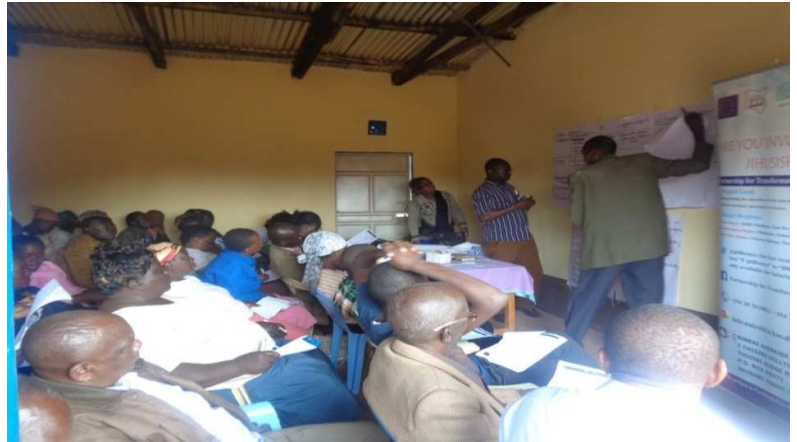
Citizens of Kaunguni Sub-ward in Makueni County participating in community scorecard focusing on Health sector

The current fiscal decentralization systems are premised on the need to enable communities to make decisions over their development needs which is one of the key objects of devolution as per article 174(c) (d) of the constitution of Kenya 2010 and also the overall objective of PTD project. In this way, development projects at the local levels will be based on the real development need of the community as a result of "KIJIHUSISHA".