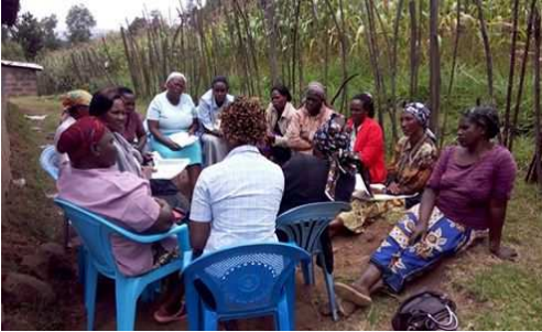
Participants during Community level Civic Awareness/Sensitization forum on County Governance processes at Elgeyo Marakwet County, Kapchebar Dispensary Ground on 22nd September 2016

Importantly, the CSC process has been able to link facility level challenges with county planning and budgeting processes. In Eldume dispensary, residents and the service providers agreed to prioritize access to road, drainage, and additional staff (support staff) in the 2017/2018 budget process.