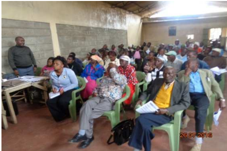
Regional Trainer-Lower Eastern discussing with the citizen of Mutituni Ward-Machakos County on Community Scorecard on Health

The gains of PTD projects has grown hand in hand with the gradual freedom of expression and participation which this country has begun to enjoy since 2010 after getting the peoples constitution. Kenyans are enthusiastic about democratizing all aspects of their social, political and economic life.