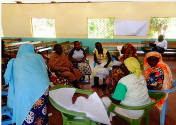
Women discussing Community score card at Ganda