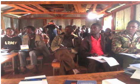
Community sensitization forum on Scorecard Methodology as means of enhancing service delivery held at West Pokot County, Kapchebar Health Centre on 11th August 2016

process in which community members and service providers together discuss their impressions and work together to improve how services are delivered. CSCs are targeted around specific services and so work best at a local level, where the 'community' and the service being evaluated can be fairly well defined. Services and projects that might be included in this are local health centres, local schools, administrative units, or projects that have a specific target community 2 . For our case, we chose to pick on health services and therefore focused on health services facilities.