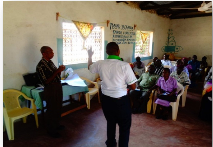
Introduction of Project Team to the Community at Mtondia Dispensary by the Area Administrator