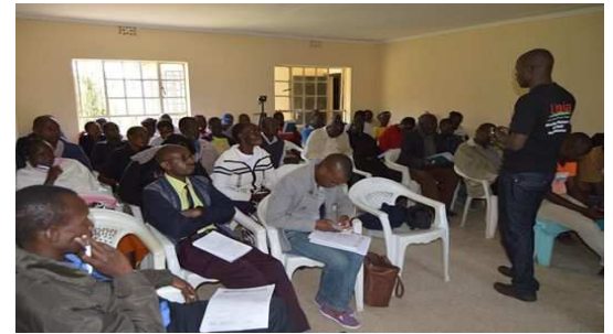
CEDGG staff addressing participants during Community Sensitization at Nakuru West Constituency, Kapkures Health Centre Nakuru on 21st July 2016

The project adopted community scorecard (CSC) as the main social accountability tool. CSCs are community-level monitoring tool, where community members and service providers come together to provide feedback on service delivery. CSCs not only provide feedback on service quality but also include a dialogue