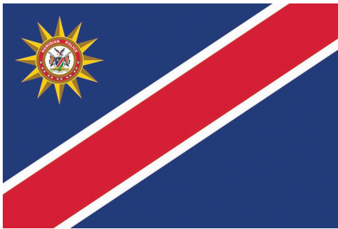
Ebandela lOpolifi yaNamibia fiyo 31 Oktoba 2009

Ebandela lOpolifi yaNamibia alushe olo hali shikula Ebandela lOshilongo ngeenge taa tulikwa oshita nEbandela lOshilongo. Ebandela lOshilongo oli na okukala la tulikwa ometa 1,80 li dule makwao.