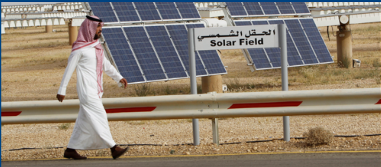
A field of solar panels at the King Abdulaziz City of Sciences and Technology.

The Gulf States were opposed to international climate protection agreements for a long time. Their economic and political dependency on oil and gas was simply too great. In recent years, however, a paradigm shift has taken place: Following the lead of other Gulf States, Saudi Arabia is now also arriving at a more progressive climate protection policy.