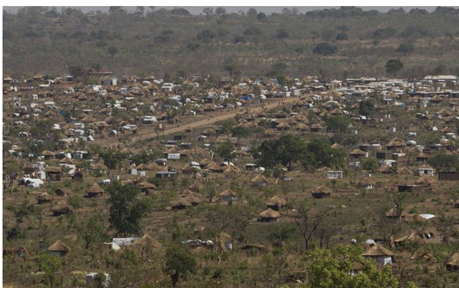
Figure 1: Aerial View of the Bidibidi refugee settlement.

It is therefore argued that Uganda’s forward-looking approach is being stretched to its limits. Uganda is currently the largest refugee-hosting country in Africa, after surpassing Ethiopia and Kenya in early 2017. Bidibidi became the largest refugee camp hosting more than 270,000 displaced persons 9 .