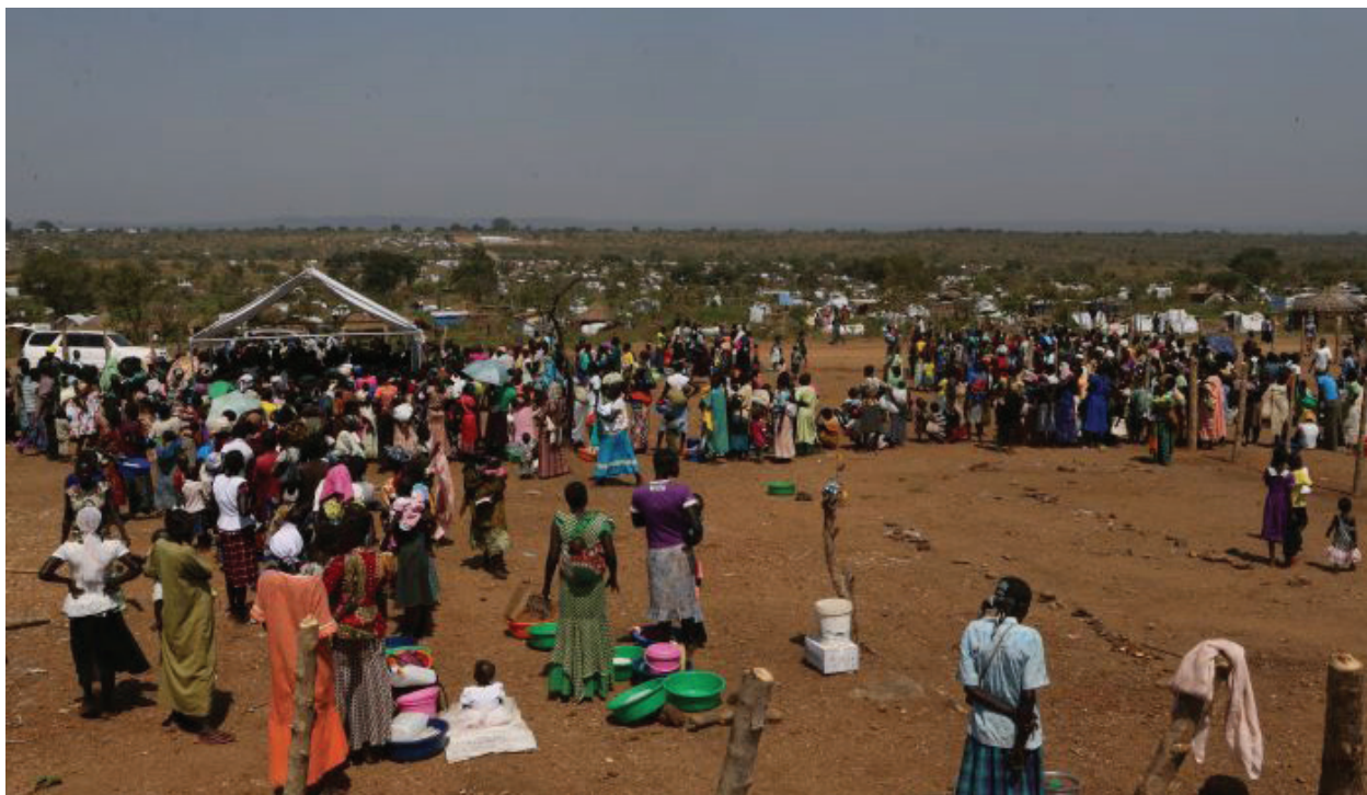
Figure 3: Refugees at the Bidibidi Refugee Camp.

In March 2017, the South Sudanese influx to Uganda peaked at over 2,800 refugees registered per day while it is projected that 1,025,000