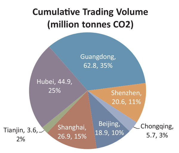
Fig. 1. Cumulative trading volume of emission allowances under the seven pilot emission trading schemes of China (up to 30 June 2017).

Updated 23 August 2017.