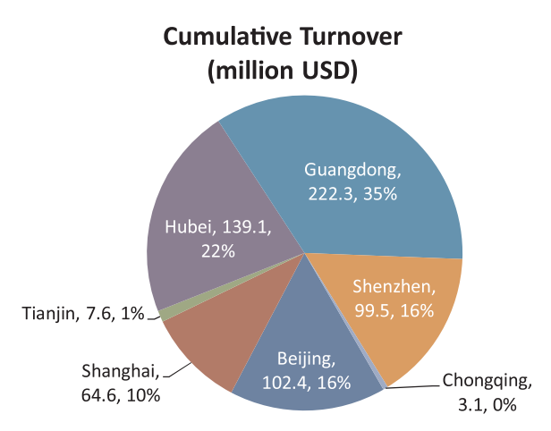
Fig. 2. Cumulative turnover of emission allowances under the seven pilot emission trading schemes of China (up to 30 June 2017).

Updated 23 August 2017.