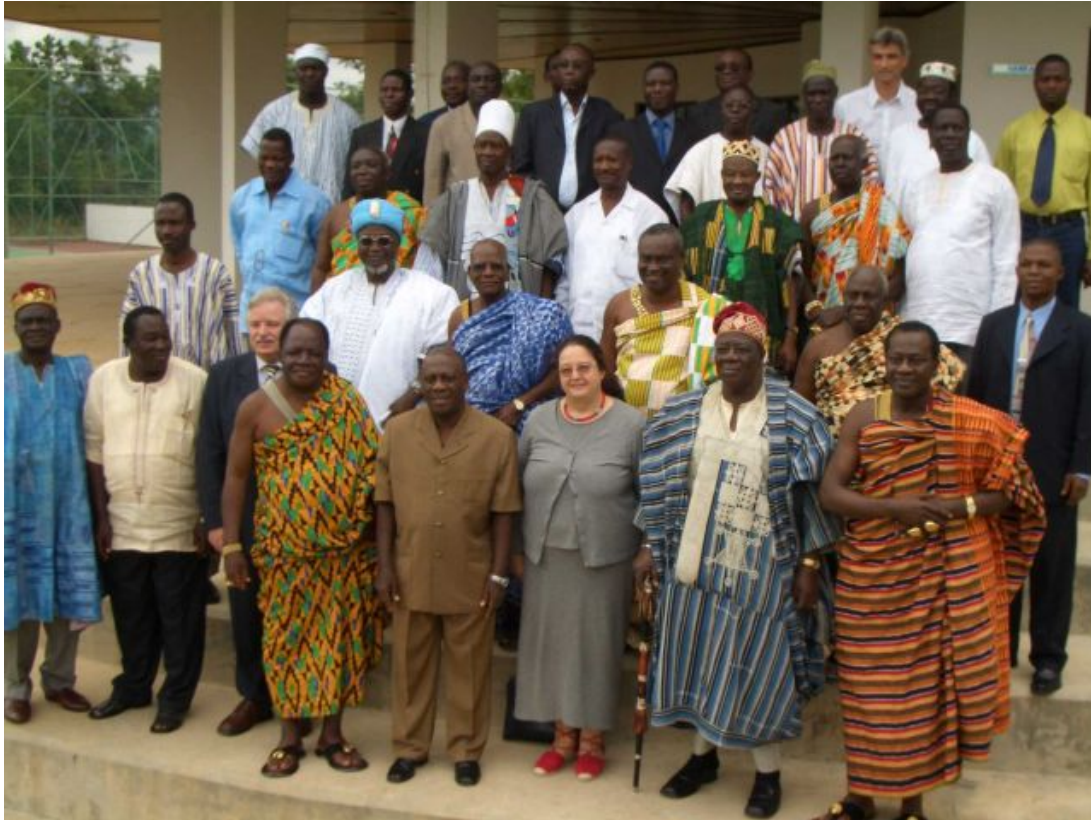
Centre (brown safari suit): The Minister of Chieftaincy and Culture, Hon. S. K. Bofo_